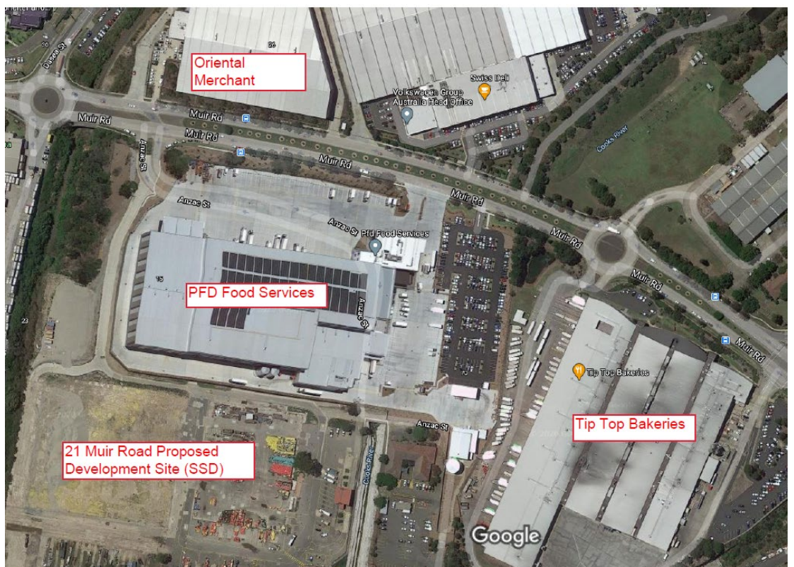
Figure 1. Subject site to the south and Oriental Merchant site to the north.

Mecone NSW Pty Ltd act on behalf of Oriental Merchant Pty Ltd, an adjoining landowner at 26 Muir Road, Chullora. We have reviewed the supporting documentation, including the Environmental Impact Statement, prepared by Arcadis, and note several omissions in the documentation. As such, we raise the following concerns, which we ask to be addressed.