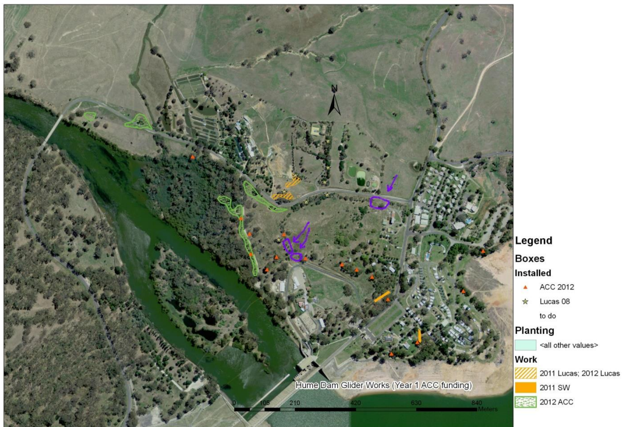
Figure 1 FLHG Corridor enhance -2013