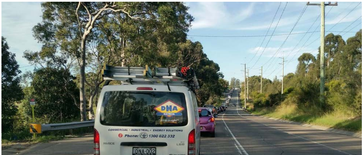
Plate 1 Mandalong Road B53. View east at 3.30pm. 9th May 2019. The cue extended into Dora Street, Morisset town centre.

Local residents are already well aware of the congestion on the B53, particularly in the afternoons. The traffic is often cued from the traffic lights in Morisset (or Fishery Point Rd) to the roundabout, south of Wyee road, to the Gateway Blvd entry to the industrial estate. Additional traffic on B53 may cause cues to extend to the M1 off ramp, which would be dangerous to southbound M1 travellers. The photo below shows typical traffic que at 3.30 on weekday afternoon, prior to dayshift at the mine ending.