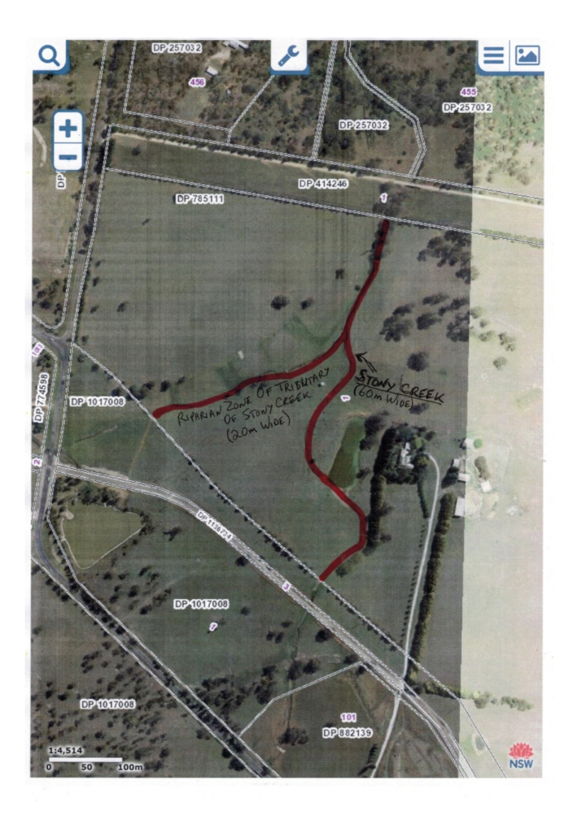
<u>ATTACHMENT 1:</u> (riparian zones to be revegetated marked in red, 30 metres each side of Stony Creek and 10 metres each side of its tributary)