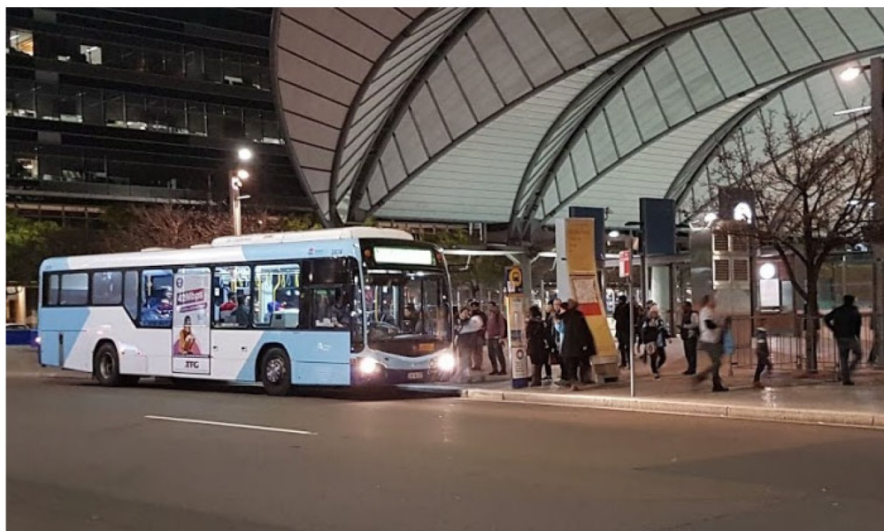
Figure 6 Existing bus stop on Australia Avenue

The bus stop on Australia Avenue serves as an interchange point with Olympic Park railway station, and is shown in Figure 6