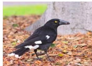
Identifying a Currawong, feature of Yellow Eyes