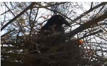
Identifying a Currawong nest and Currawong

Tree opposite Pack & Send, corner of Edward St & Pyrmont Bridge Road (overhanging road)