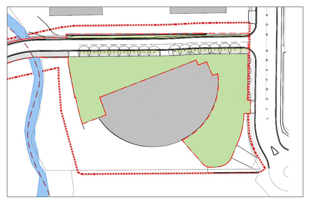
Figure 4 – Stage 1 Extent Area

As indicated in Figure 4 below (sourced from Stage 1 Overview Drawings – Appendix A), it appears that a portion of our site has been incorporated into the designated Stage 1 Extent Area. It must be noted that we have not provided consent for our site to be included in the Extent Area, and that we are concerned about the repercussions and implications of its inclusion. We ask that the applicant either seek our permission for our site to be included in the extent area or amend all and any figures or images accordingly.