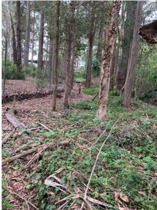
Degraded weed infested area leading to rear of PLC from Golfers Glen adjacent to firebreak (above); Location of Golfers Glen, Greenway Drive, in relation to PLC