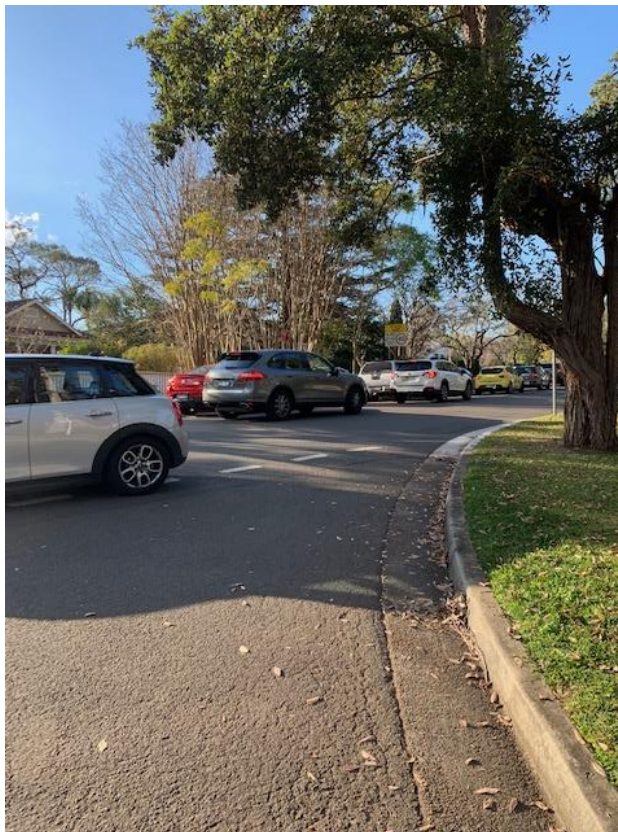
Traffic banked up blocking Avon Rd on 23 July 2020 during the afternoon of a normal school day