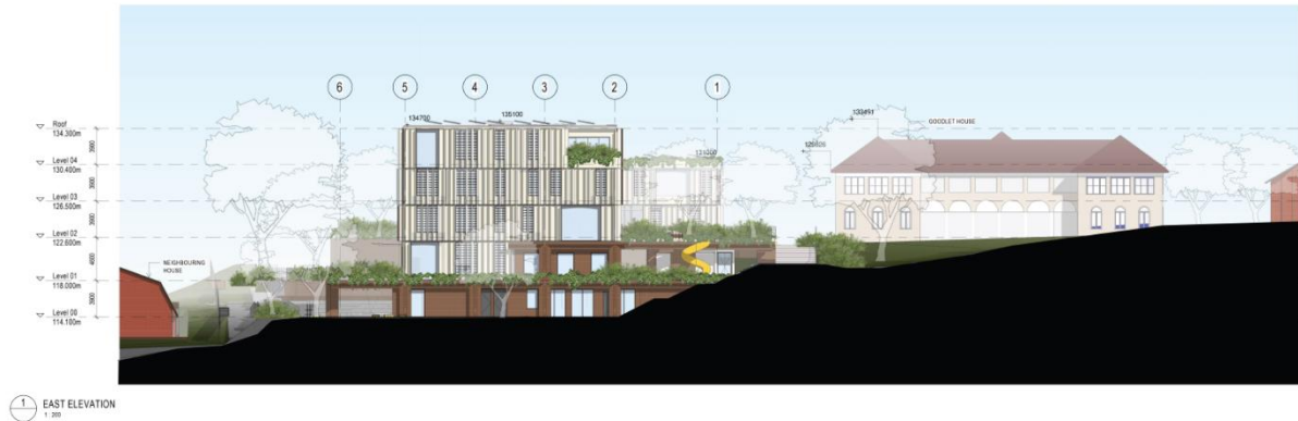
Figure 1: Extract of architectural drawings showing eastern elevation (Dwg No. DA-C10-AA-02) of the proposed development (Source: BVN Architecture)

The proposed five storey (5) Grey House building is of a bulk, scale and design that is unsympathetic to the low-density residential environment to the south east. The proposed building should be amended to be of a lesser height, more recessive in design, bulk and scale and provide a transition in scale to the two (2) storey dwellings directly to the south.