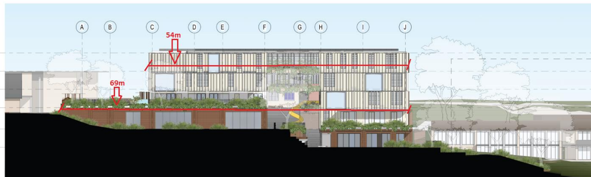
Figure 2: Extract of architectural drawings showing southern elevation (Dwg. No. DA-C10-AA-01) of the proposed development

The approved masterplan (SSD 5314/2013) envisioned (despite not applying to the particular section of the site) a maximum of two (2) storeys across the entire school site, with maximum building envelopes ranging in height from 6-12m. The proposed building is five (5) storeys and a maximum of 20.6m in height, spanning a length of 62m. Therefore, it is considered that the proposed building is inconsistent with the overall vision for the school.