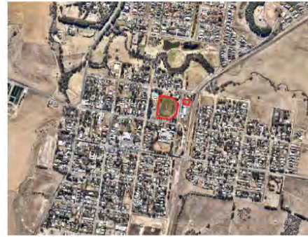
Option 2 – Council Lands

Approximate site area: 0.17ha of council land & 2.2ha of playing field (approx.)