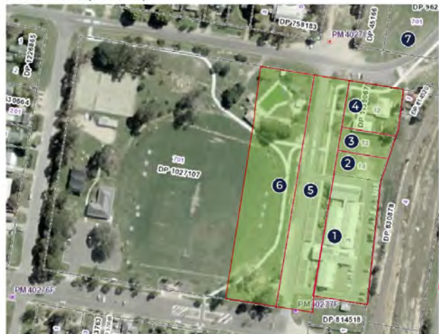
FIGURE 1: Site Acquisition Map

We’re going to lose the land marked below, forever. And be banned from most of the rest of the Park, most of the time. And lose a huge chunk of the Common: