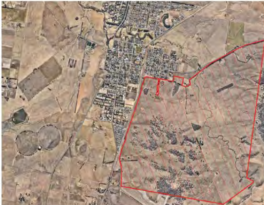
Option 7 – New Council Lands

Approximate site area: Up to 827 hectares of land available