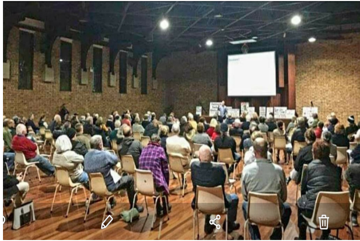
Picture from our hastily convened Public meeting held on the 2th of June to inform residents only 200 seats were available due to COVID restrictions all seats were filled