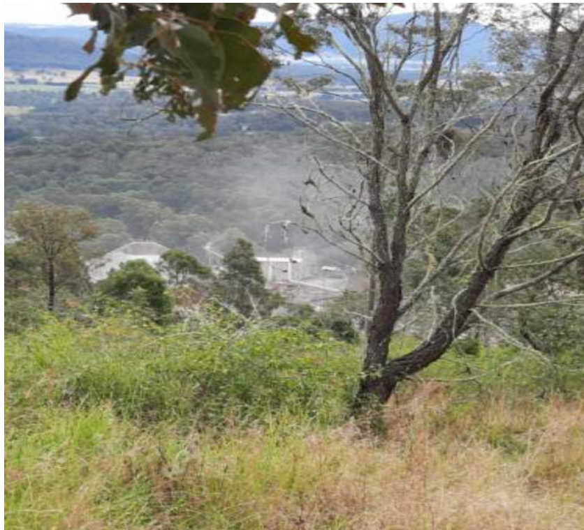
Picture from Vogeles Rd Martins Creek taken by resident, of the quarry on June 8 th 2021

“I noticed this dust cloud over the quarry cloud over the quarry when I was driving home, so stopped and took a series of photos from above the quarry. In just the short time I was there the effect of the dust on my nose and throat was quite unpleasant”