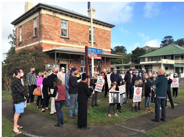
Picture from hastily called press release 30 minutes notice on a week day 29 th 2021, residents of Paterson and surrounds the residents are concerned about the Quarry expansion