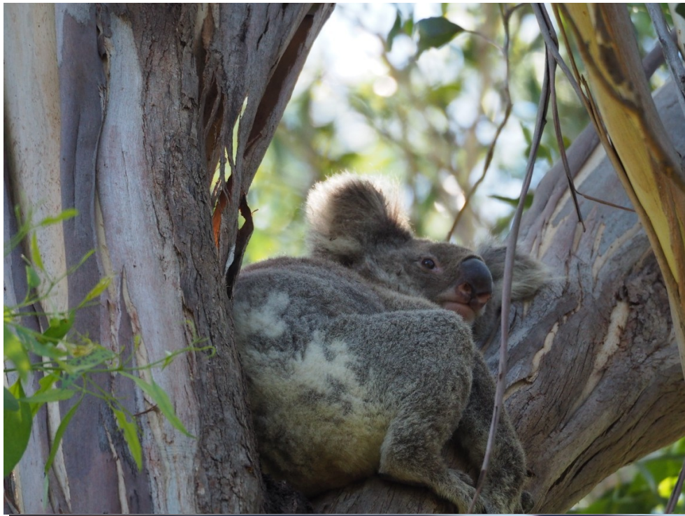
Pictures of Koalas taken from a number of local residents who's properties boundary is Martins Creek Quarry taken during 2021