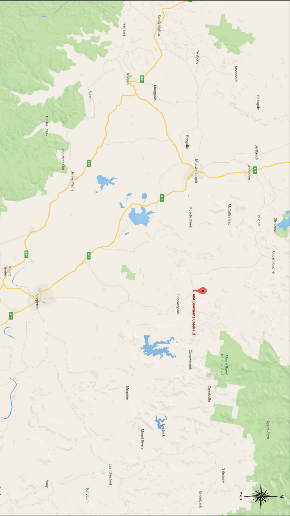
FIGURE 1 Locality Plan