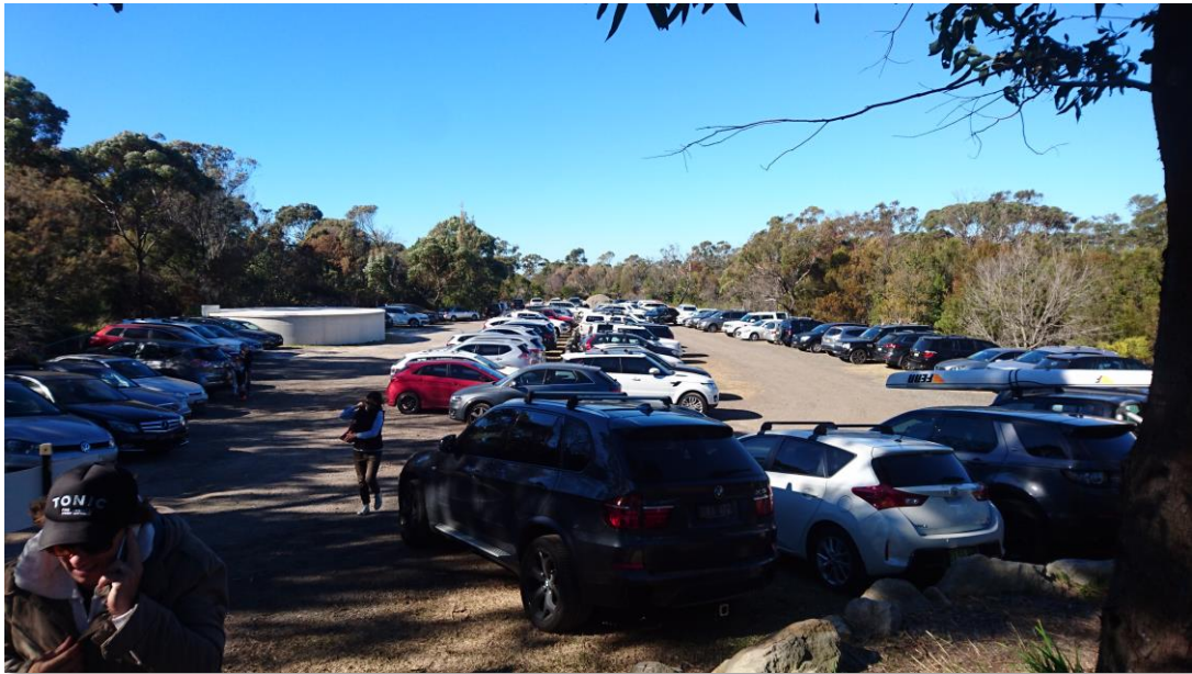
Lower car park full