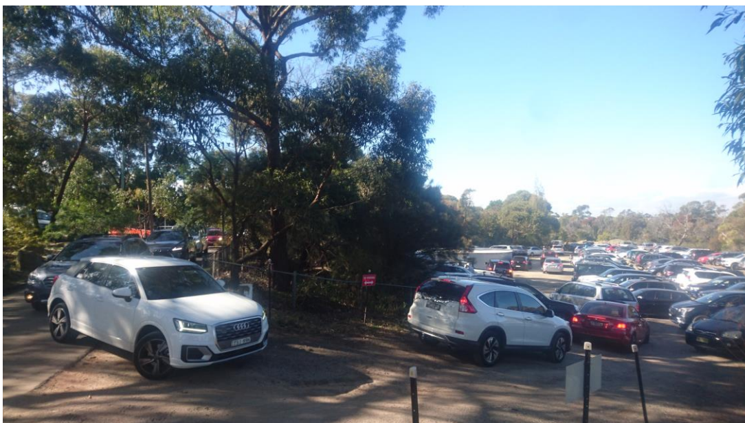
Lower car park gridlock

Below are photos demonstrating what the car parking areas are like every weekend.