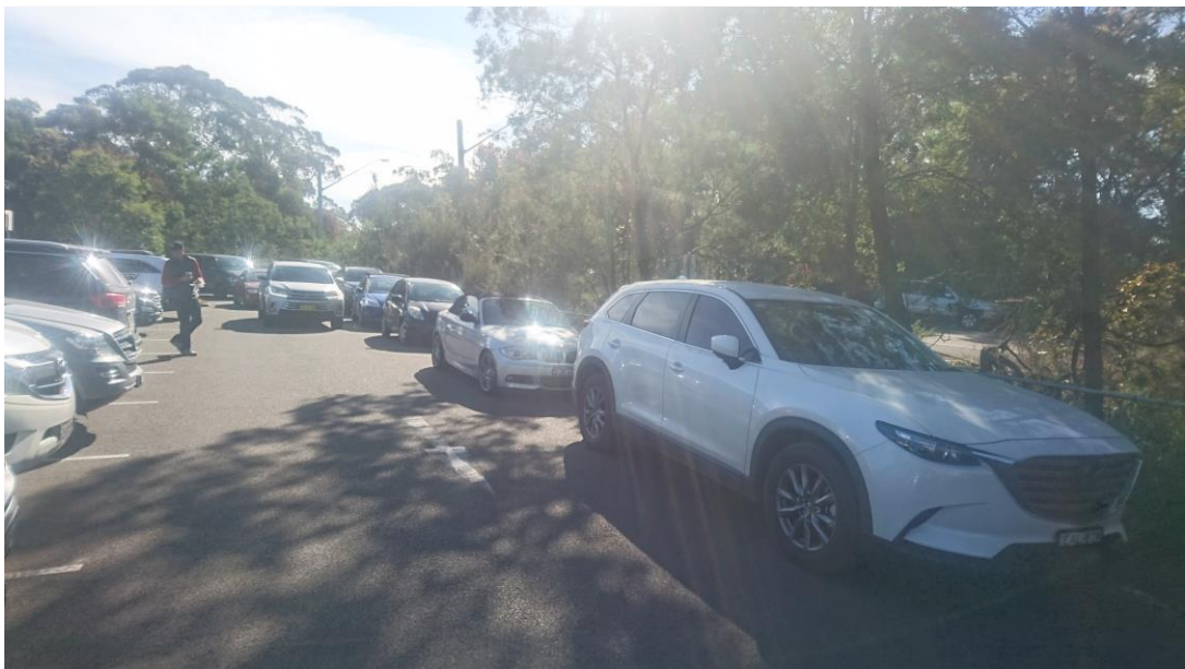
Upper car park illegal parking