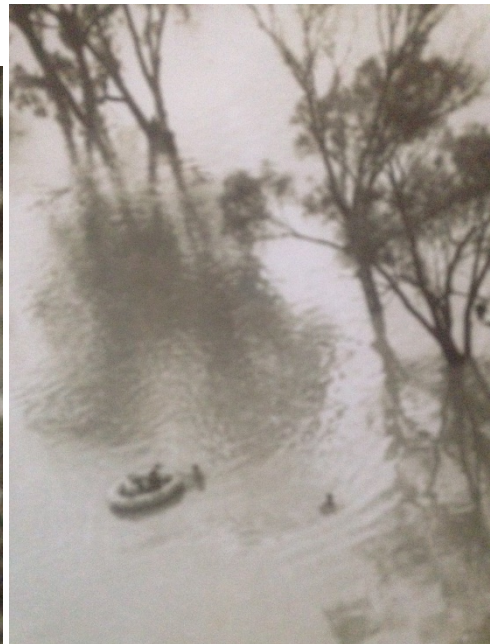
Webb family rescued by neighbours

Indeed, the Wallaby Road has been closed for months at a stretch during the 2016 and 2020 years. That alone should serve as a warning bell to the Inland Rail team.