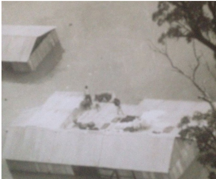
Webb Family on woolshed roof 1955 flood

These photos have been shown to inland rail and we have also gone to great lengths describing the prolonged saturation events that occur with discharge of runoff water from the Harvey Ranges allowing continual flooding of the Wallaby Road and adjacent areas for months at a stretch. It should be noted that the flood depth at the junction of Dappo and Wallaby Rd rose to 2.4 metres in the 1955 flood.