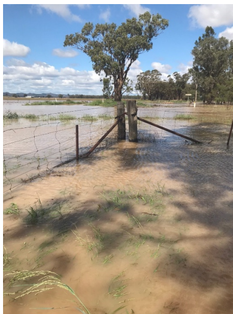
Typical storm water runoff at the junction of Dappo and Wallaby Roads

Indeed, the Wallaby Road has been closed for months at a stretch during the 2016 and 2020 years. That alone should serve as a warning bell to the Inland Rail team.