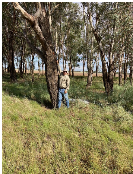
These beautiful shade trees will be destroyed in the construction of Inland Rail. Please note that where I am standing, flood water in 1955 reached 2.4 metres in depth.

Their plans to put a rail through our only established shade trees means that 30 years of perseverance will be lost. We will have no well-established trees to give our stock shade in the heat of summer. We will also lose our ability to water stock on the eastern side of their proposed rail corridor.