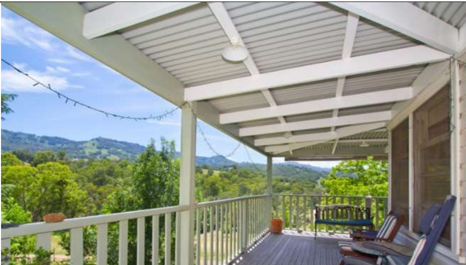
Photo 2 Portion of the mountainous view from the homestead verandah