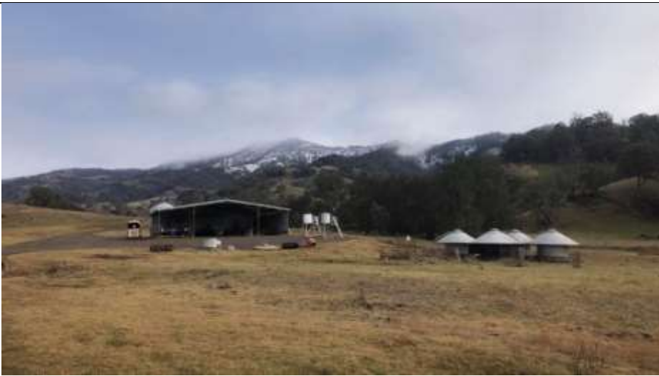
Photo 1 View of Crawney Pass from Crawney Station.