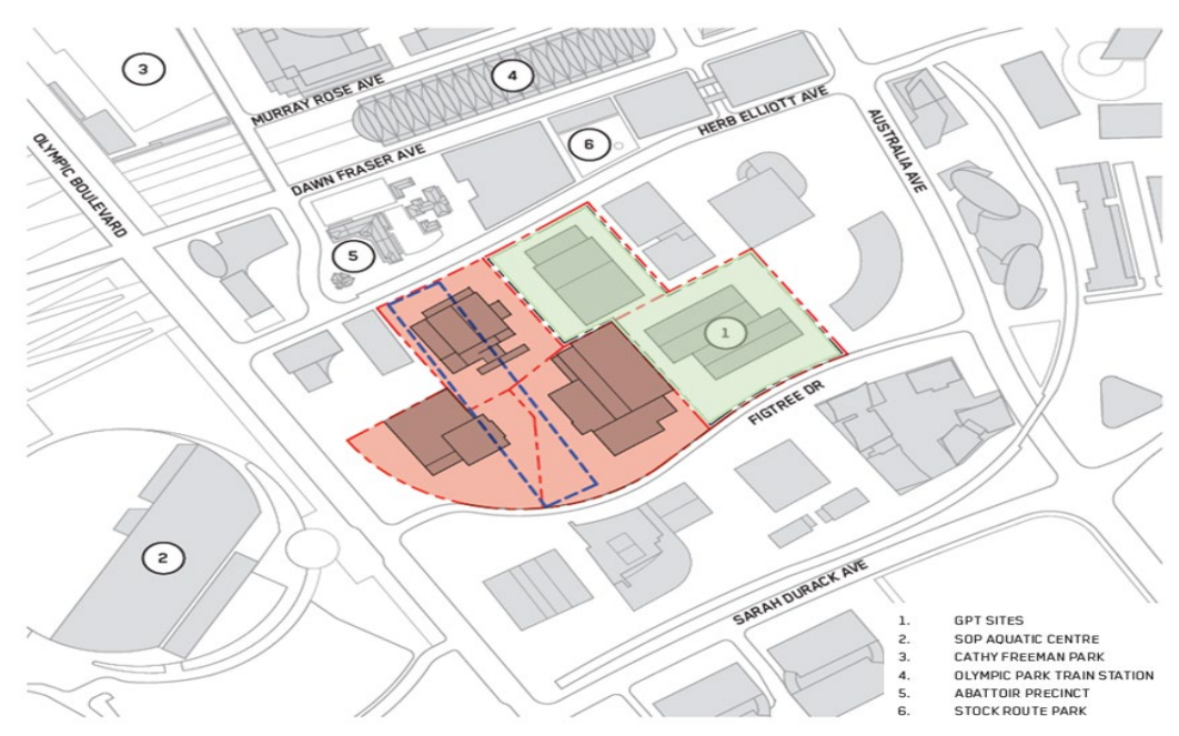
Figure 1: GPT sites (red outline), Metro station box (blue outline), Metro Construction Zone (shaded orange), GPT additional land (shaded green).

The announcement of the new metro station at Sydney Olympic Park and confirmation of its location on GPT's land, together with the opportunity to continue our working relationship with the NSW Government came as welcome news to GPT. GPT owns long term leaseholds of 5.2ha of contiguous properties within the Central Precinct at Olympic Park, which are poised to play a pivotal role in the shaping of this precinct (refer to Figure 1 ).