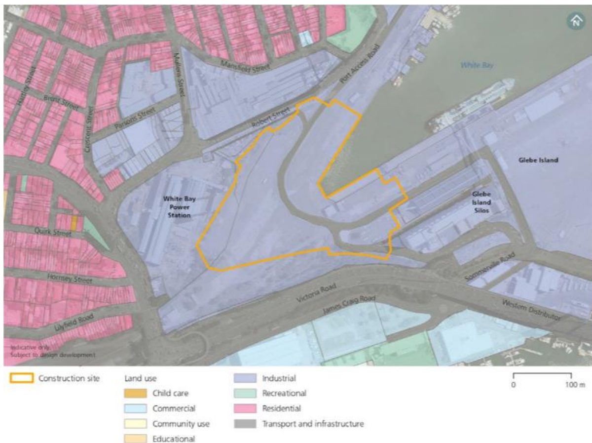
Figure 3 – The Bays Station Existing Land Use (Metro West EIS – Concept and Stage 1, Figure 14-10)

Council is extremely concerned about the misinterpretation of land use in the area, with industrial zoned sites fronting Victoria Road, Crescent Street, Parson Street and Robert Street being represented as Residential. This illustrated residential use is not reflective of the existing land uses or Council's policy context.