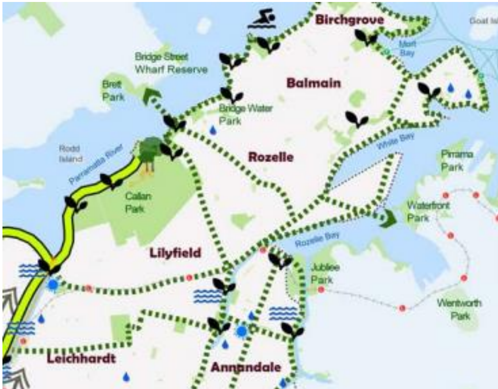
Figure 1 - Indicative blue/green grid along Bays Precinct (Inner West Council LSPS)