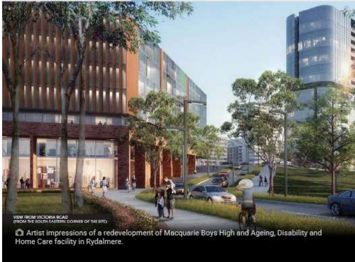
VIEW FROM VICTORIA ROAD (FROM THE SOUTH EASTERN CORNER OF THE SITE)