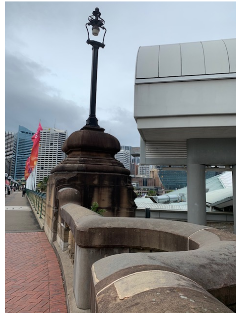
Figure 3/4: Derelict station demonstrates impact of any structures too close to historic bridge

Why is it that we seem intent on dwarfing the magnificent Heritage Bridge and building higher and higher in Sydney? Why not be more grounded and appreciate the low-rise magnificence which allows our eyes to see further and observe the existing features that are the pleasure of our Darling Harbour?