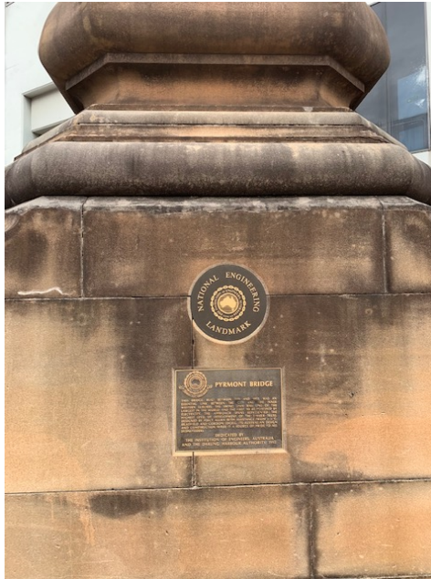
Figure 2: Heritage of Pyrmont Bridge

One of those mistakes is the derelict station still existing adjacent to the Pyrmont Bridge West approach (see Figure 3/4 ). This must be removed and NOT replaced with anything adjacent to the Historic bridge. The old station is tall and impinges of the Pyrmont Bridge due to its height and proximity.