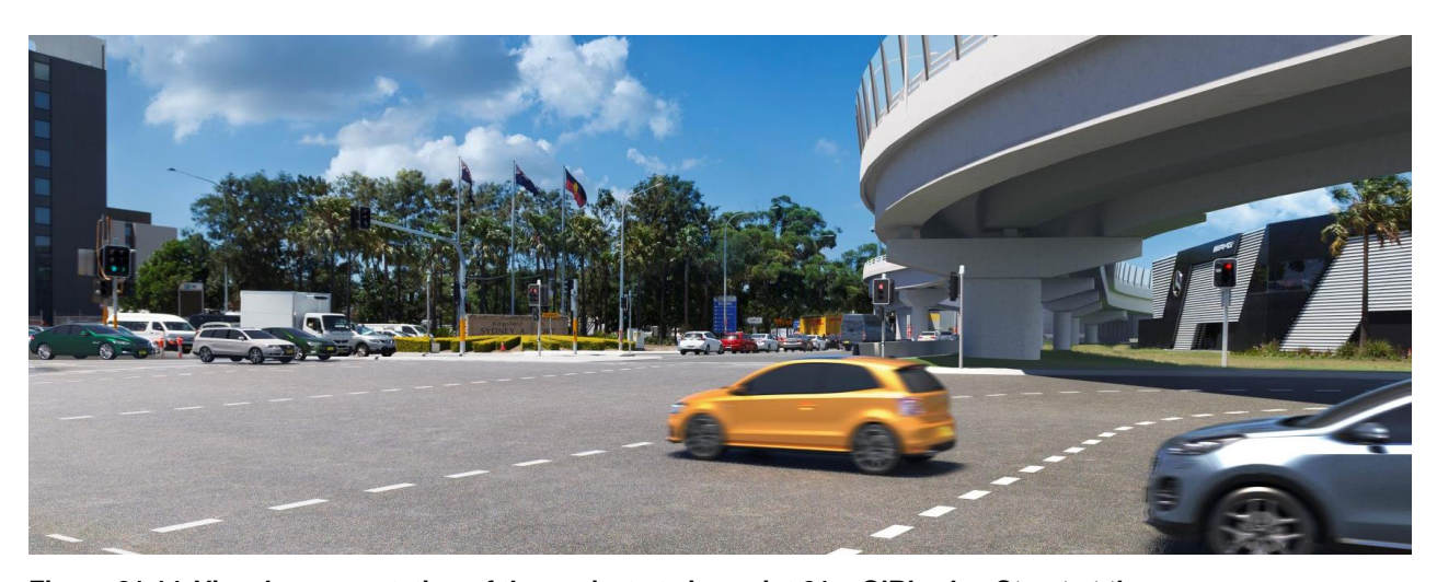
Figure 21.14 Visual representation of the project at viewpoint 21 – O'Riordan Street at the intersection with Qantas Drive