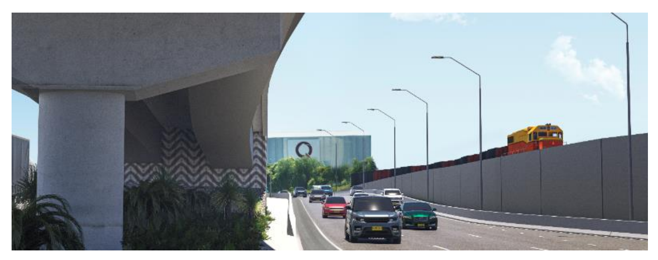
Figure 21.13 Visual representation of the project at viewpoint 19 – Qantas Drive between Robey and Ewan streets