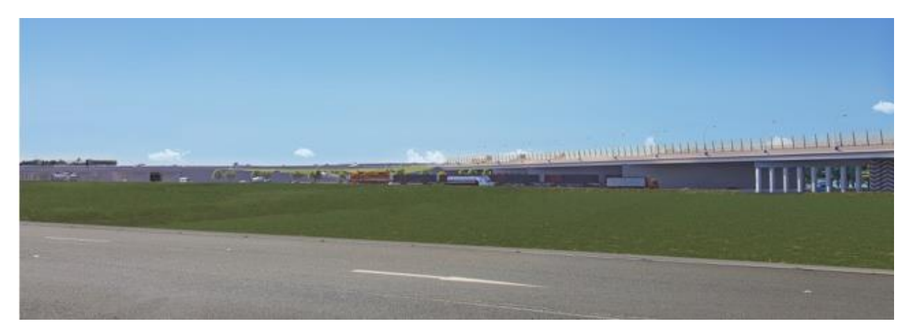
Figure 21.7 Visual representation of the project at viewpoint 10 – North Precinct Road