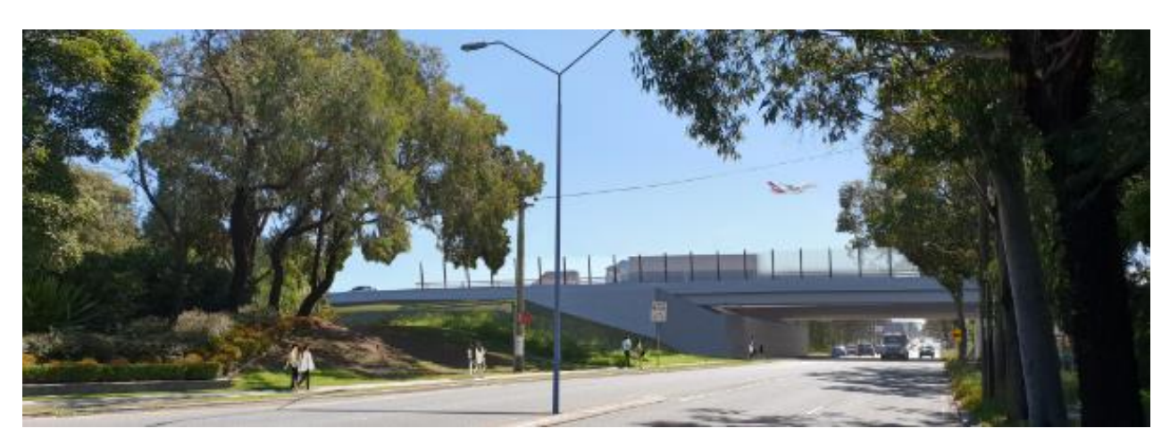
Figure 21.10 Visual representation of the project at viewpoint 13 – Bus stop on the northern side of Canal Road