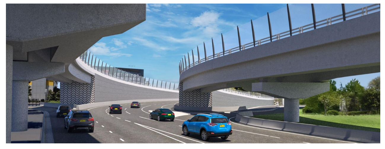
Figure 21.15 Visual representation of the project at viewpoint 23 – Sir Reginald Ansett Drive