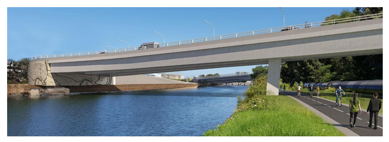
Figure 21.9 Visual representation of the project at viewpoint 12 – Access track along the western side of Alexandra Canal