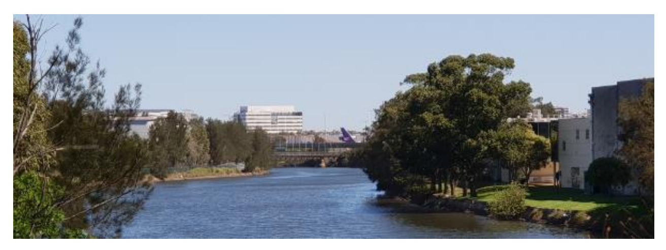
Figure 21.11 Visual representation of the project at viewpoint 14 - Canal Road bridge over Alexandra Canal