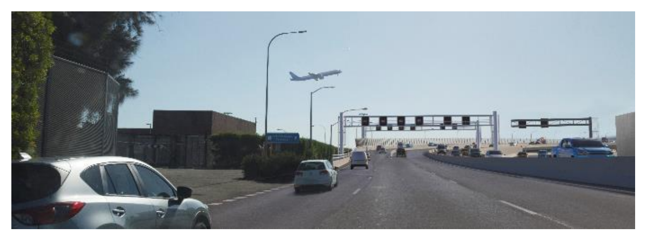
Figure 21.12 Visual representation of the project at viewpoint 17 – Qantas and Airport Drive junction