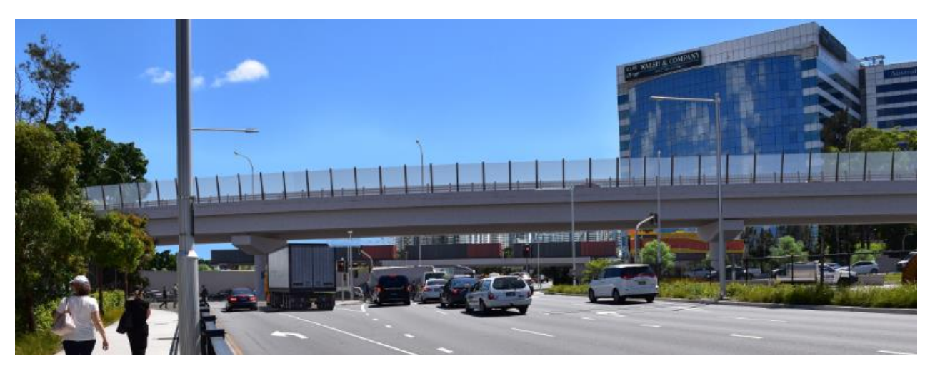
Figure 21.16 Visual representation of the project at viewpoint 24 - Seventh Street