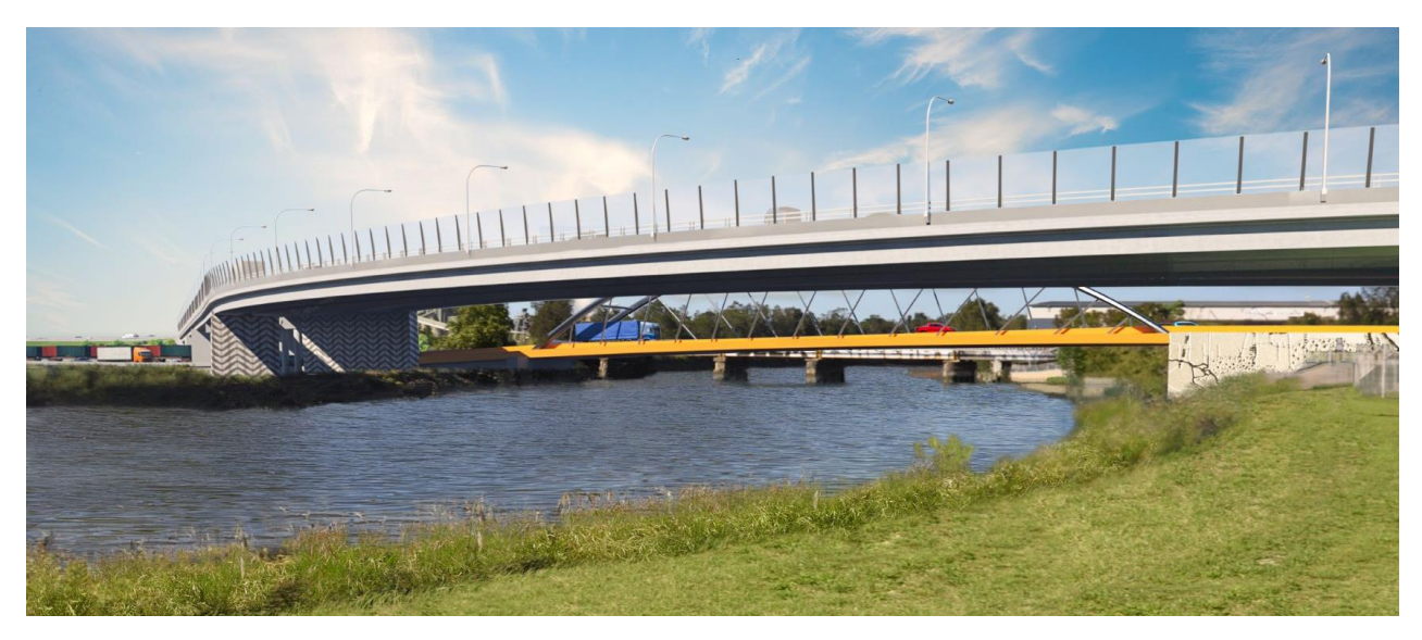
Figure 21.8 Visual representation of the project at viewpoint 11 – Alexandra Canal cycleway near Shea's Creek underbridge