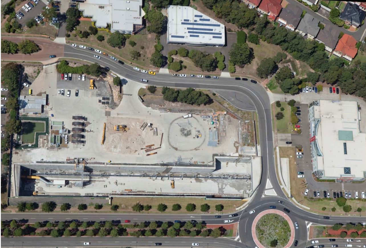
Figure 3 - Aerial View of the Sydney Metro Norwest Station Site