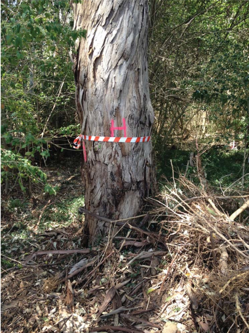
Figure 8 - Demarcation of Retained Flora