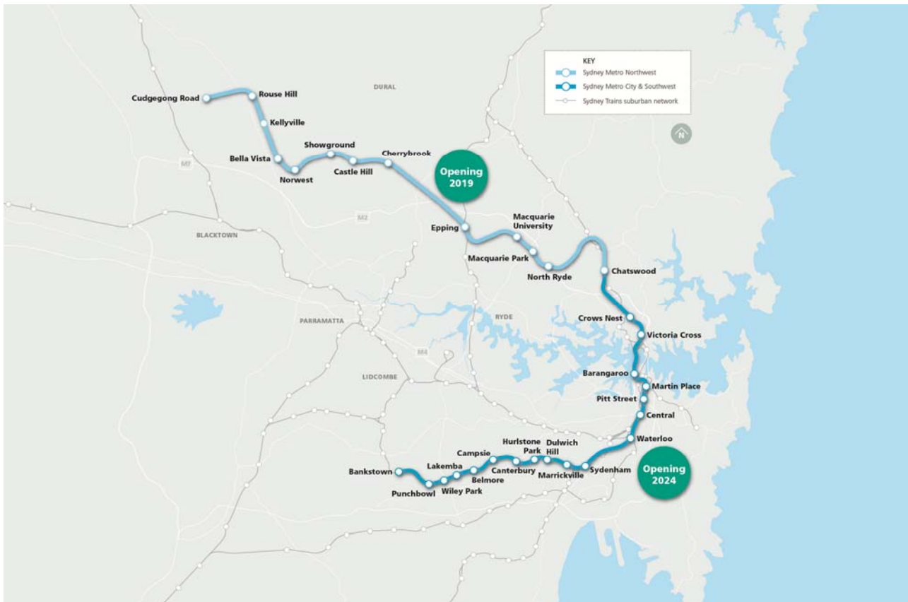
Figure 1 1 The Sydney Metro network

The SMDO has been established as part of Transport for NSW to manage the planning, procurement and delivery of the Sydney Metro network.