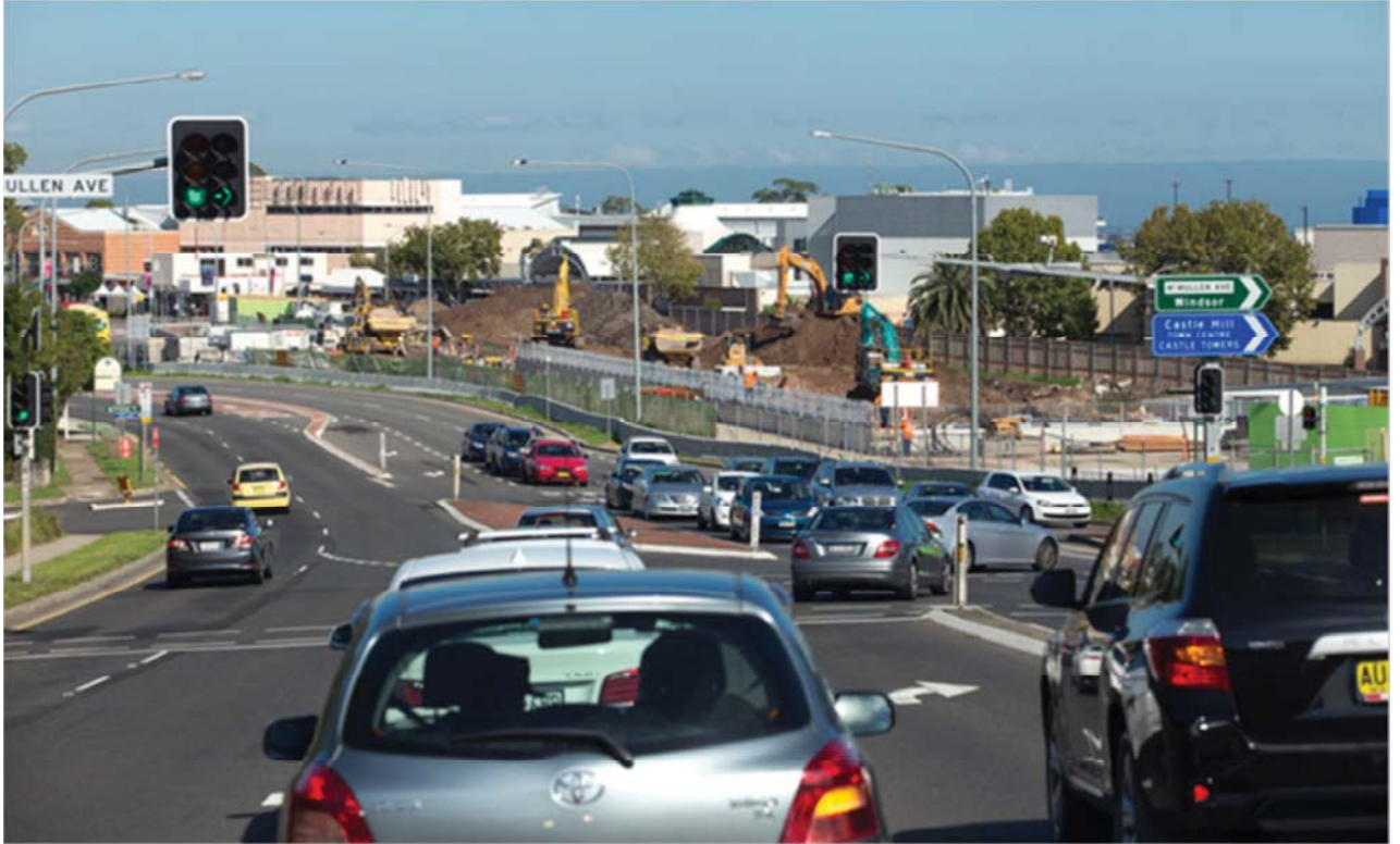
Figure 5 – Castle Hill Station Site at the Intersection of Old Northern Rd and McMullen Ave