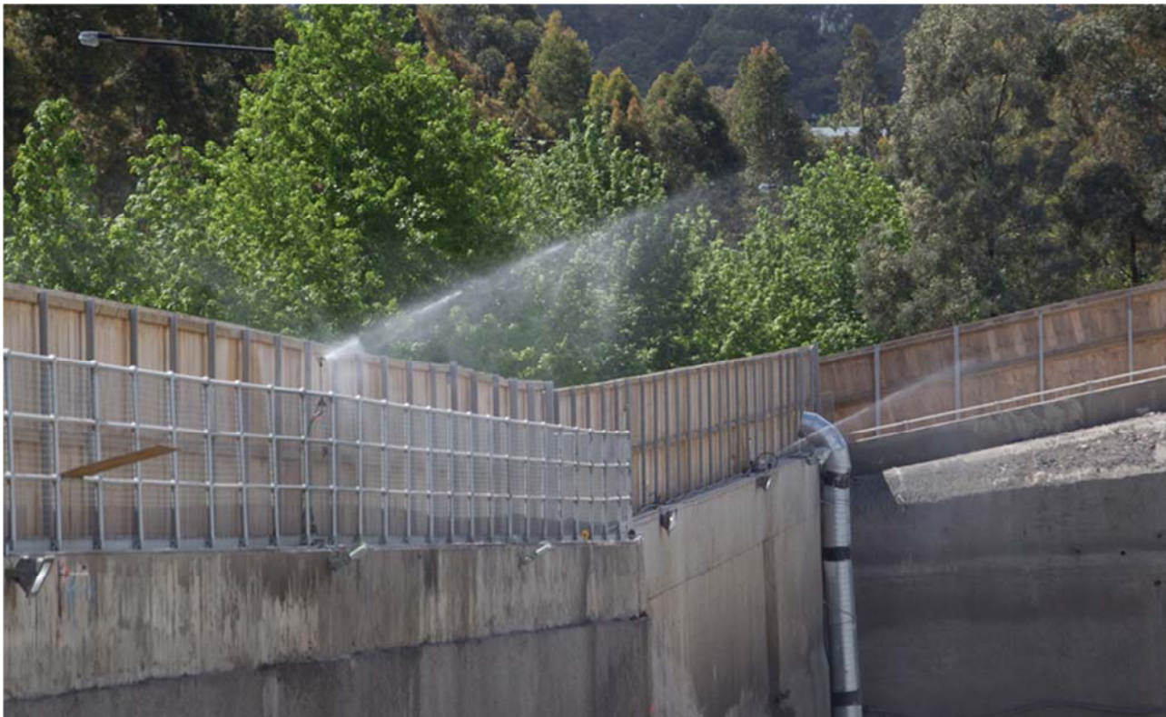
Figure 11 - Dust Mitigation at Norwest Station Site