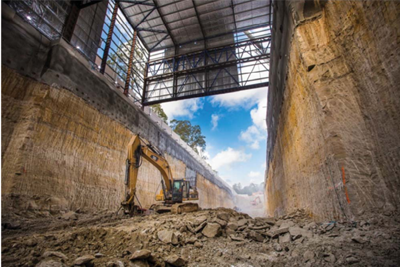
Figure 4 - Spoil and Excavation Works at the Showground Station Site