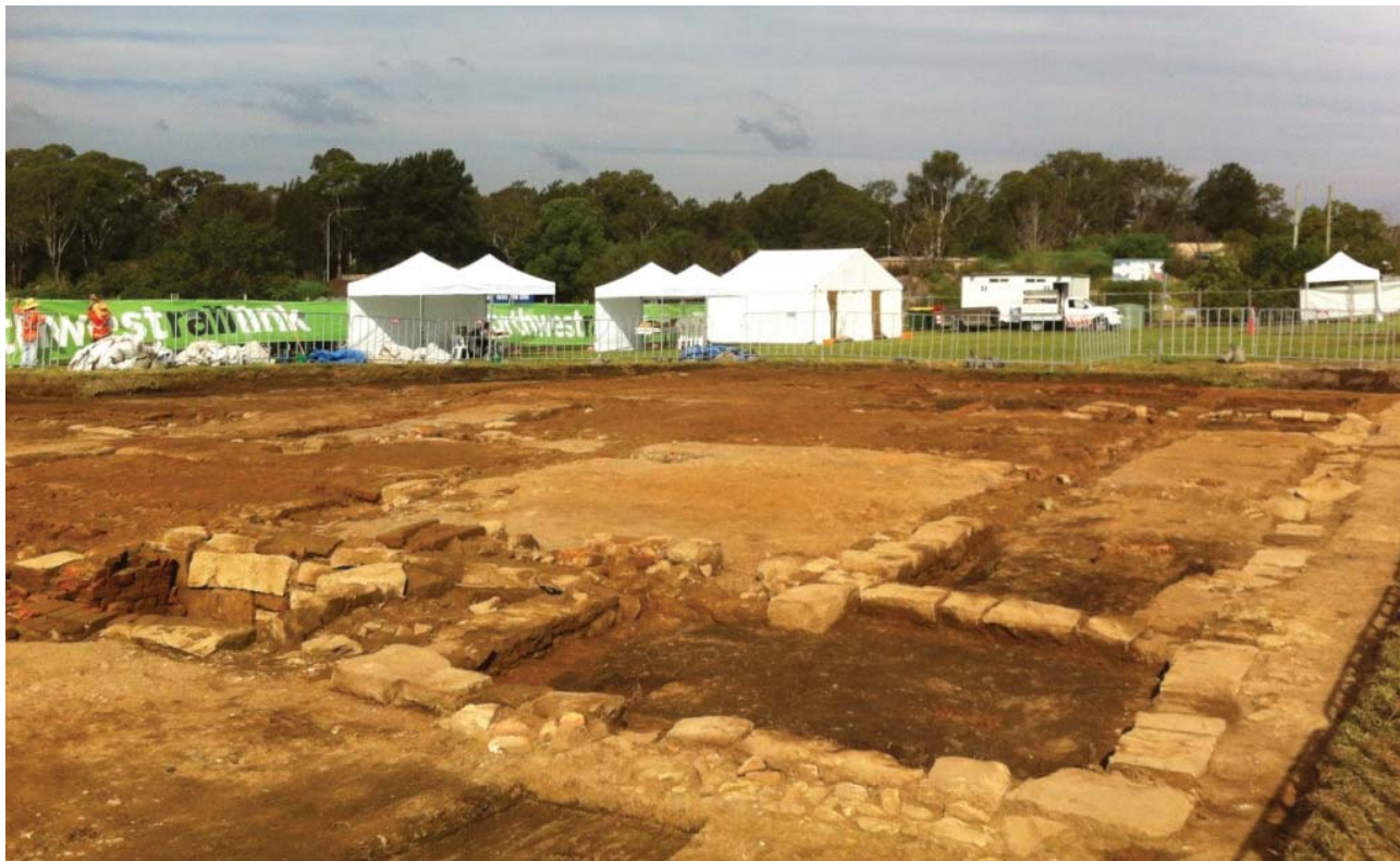
Figure 7 –White Hart Inn Excavation Site