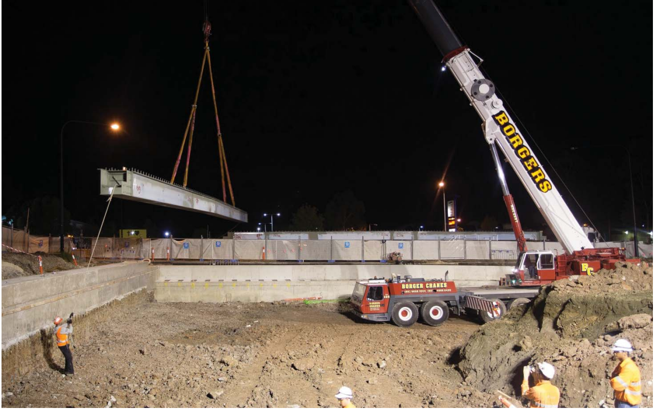
Figure 9 - Sydney Monorail Beams being re-used at the Norwest Station Site