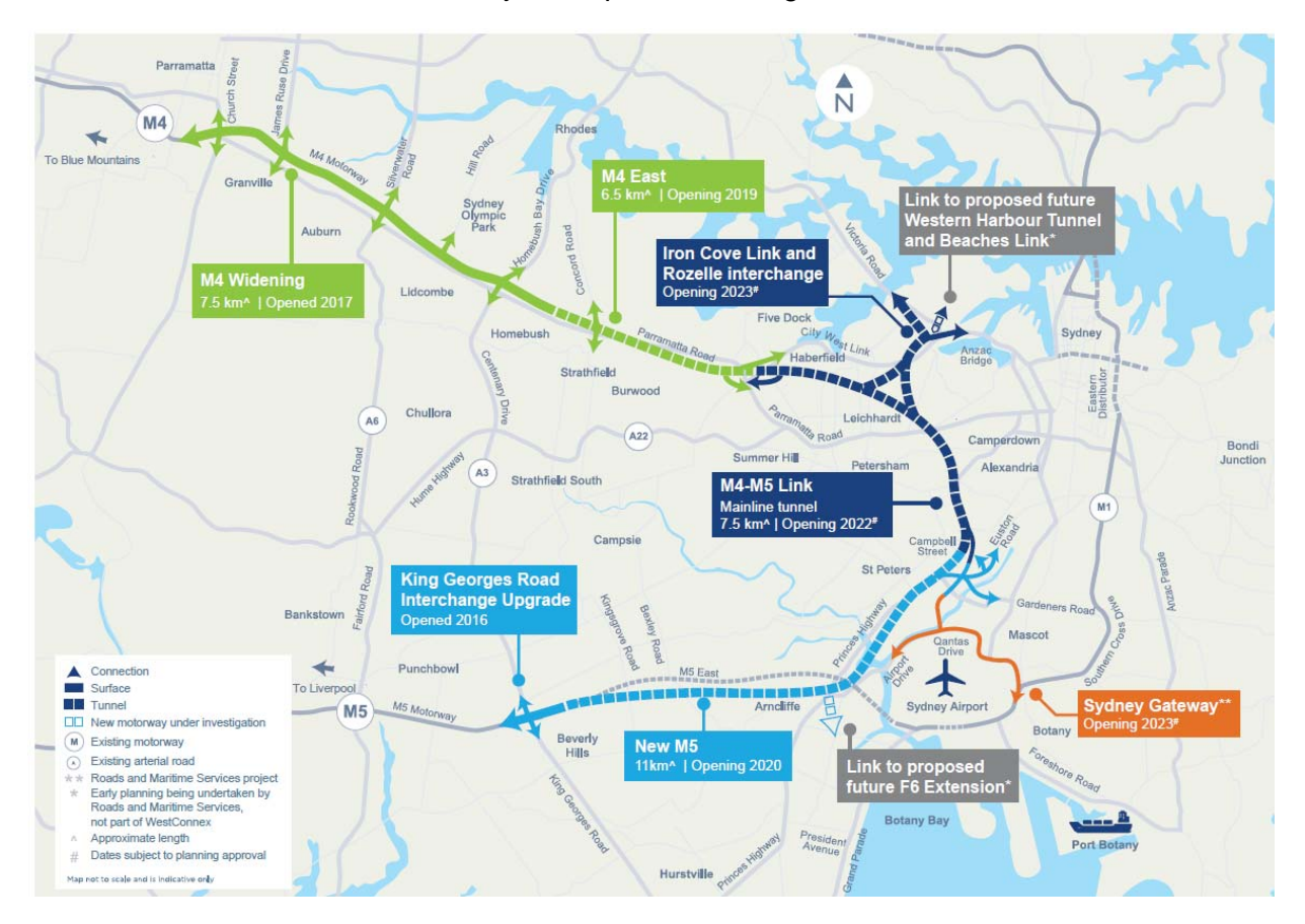
Figure A1: Overview of WestConnex

An overview of the WestConnex Projects is provided in Figure A1.