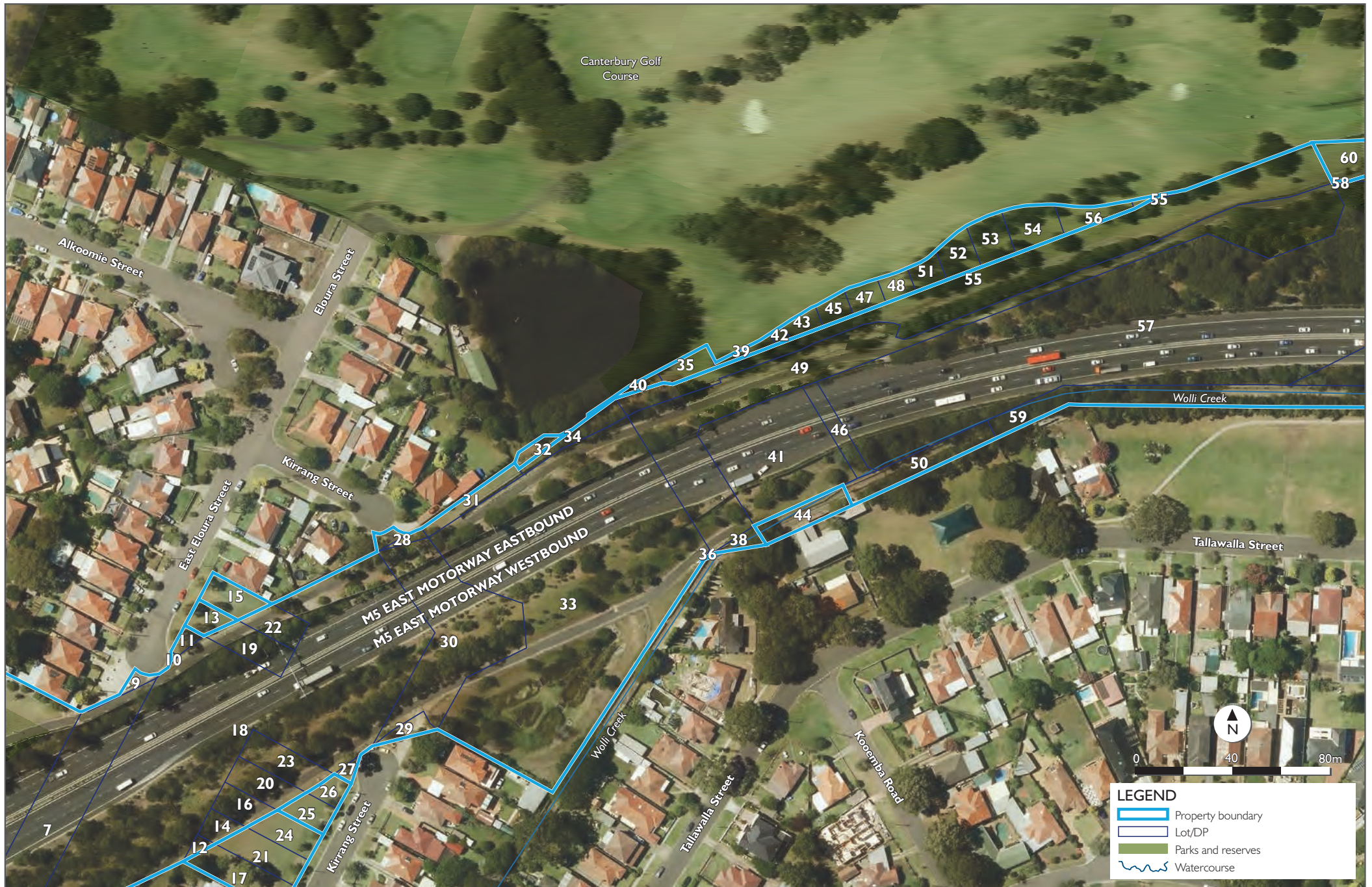
Figure D-2 Properties impacted by the project - Map 2