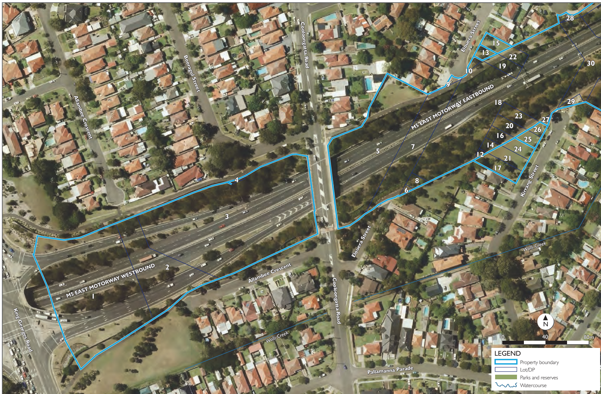
Figure D-1 Properties impacted by the project - Map 1