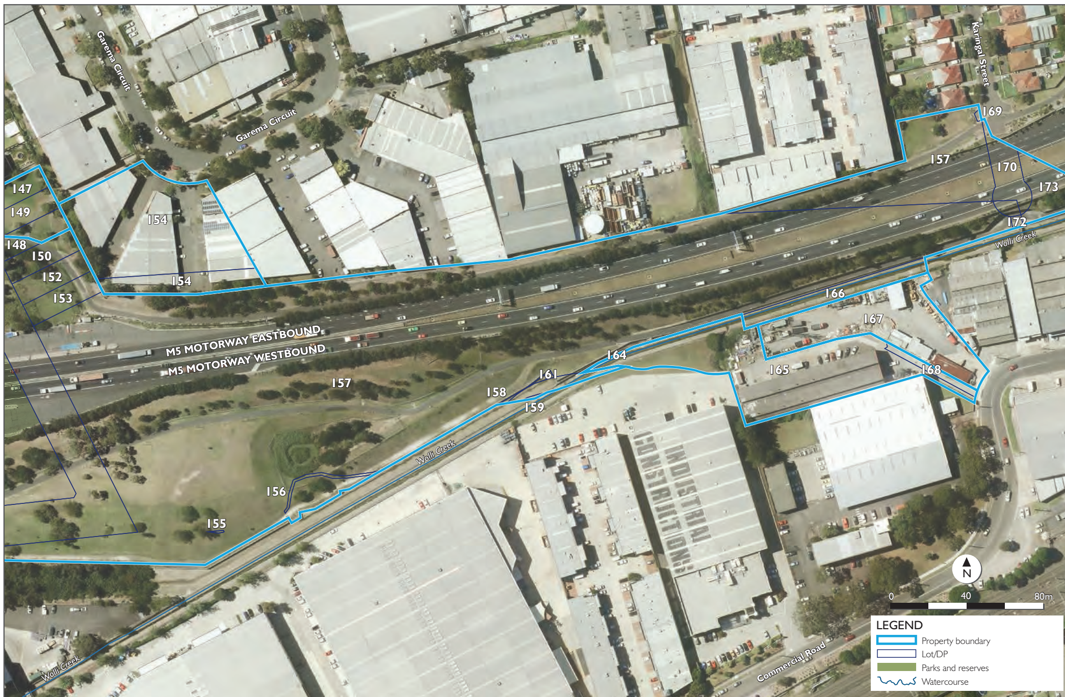
Figure D-4 Properties impacted by the project - Map 4