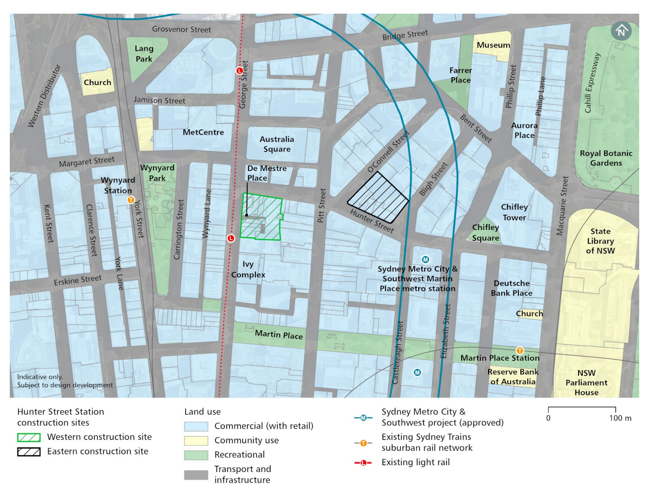
Figure 10-4 Hunter Street Station construction sites - primary existing land uses