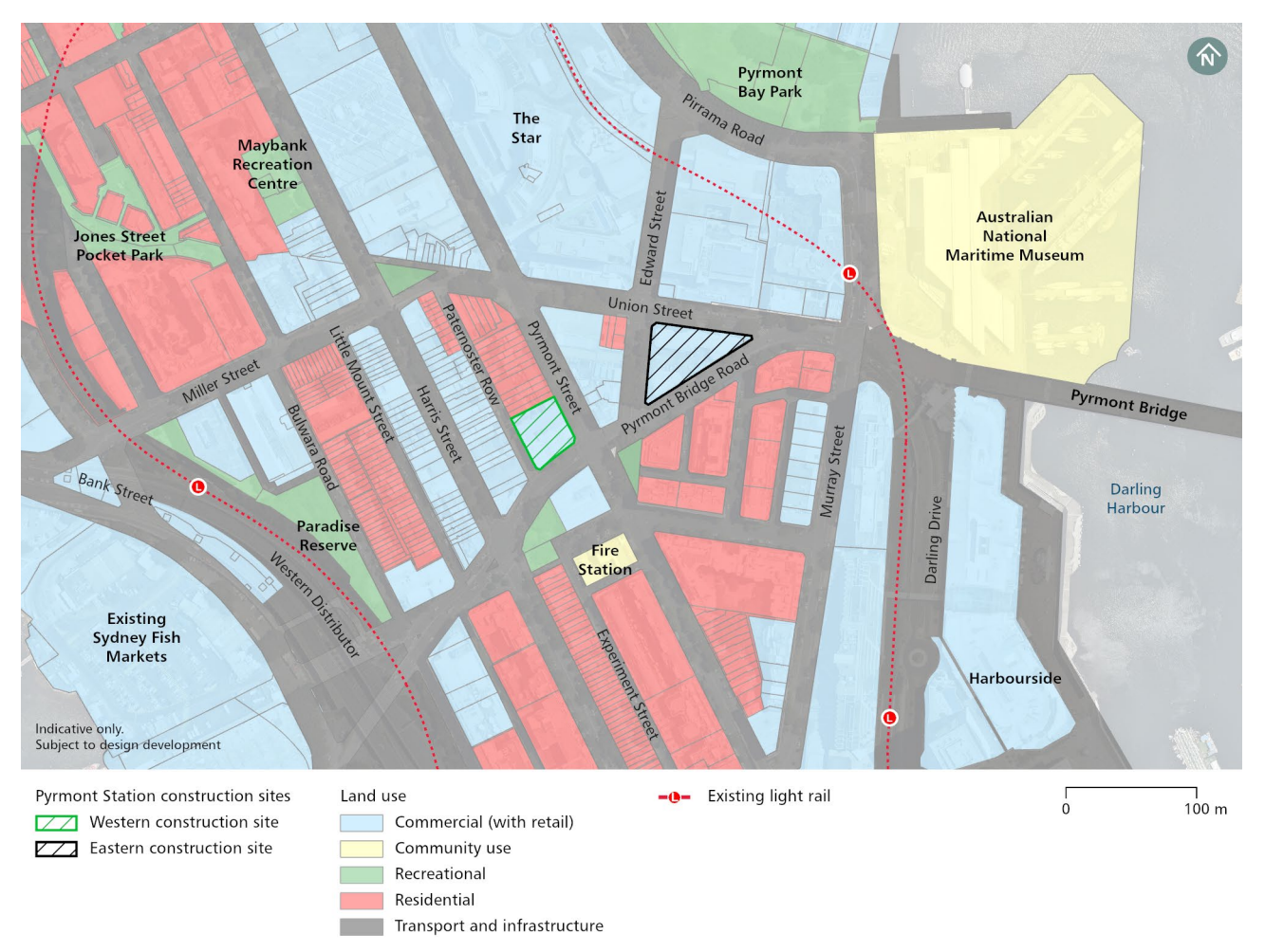
Figure 10-3 Pyrmont Station construction sites - existing primary existing land uses

Primary land uses within and surrounding the Pyrmont Station construction sites are shown in Figure 10-3.