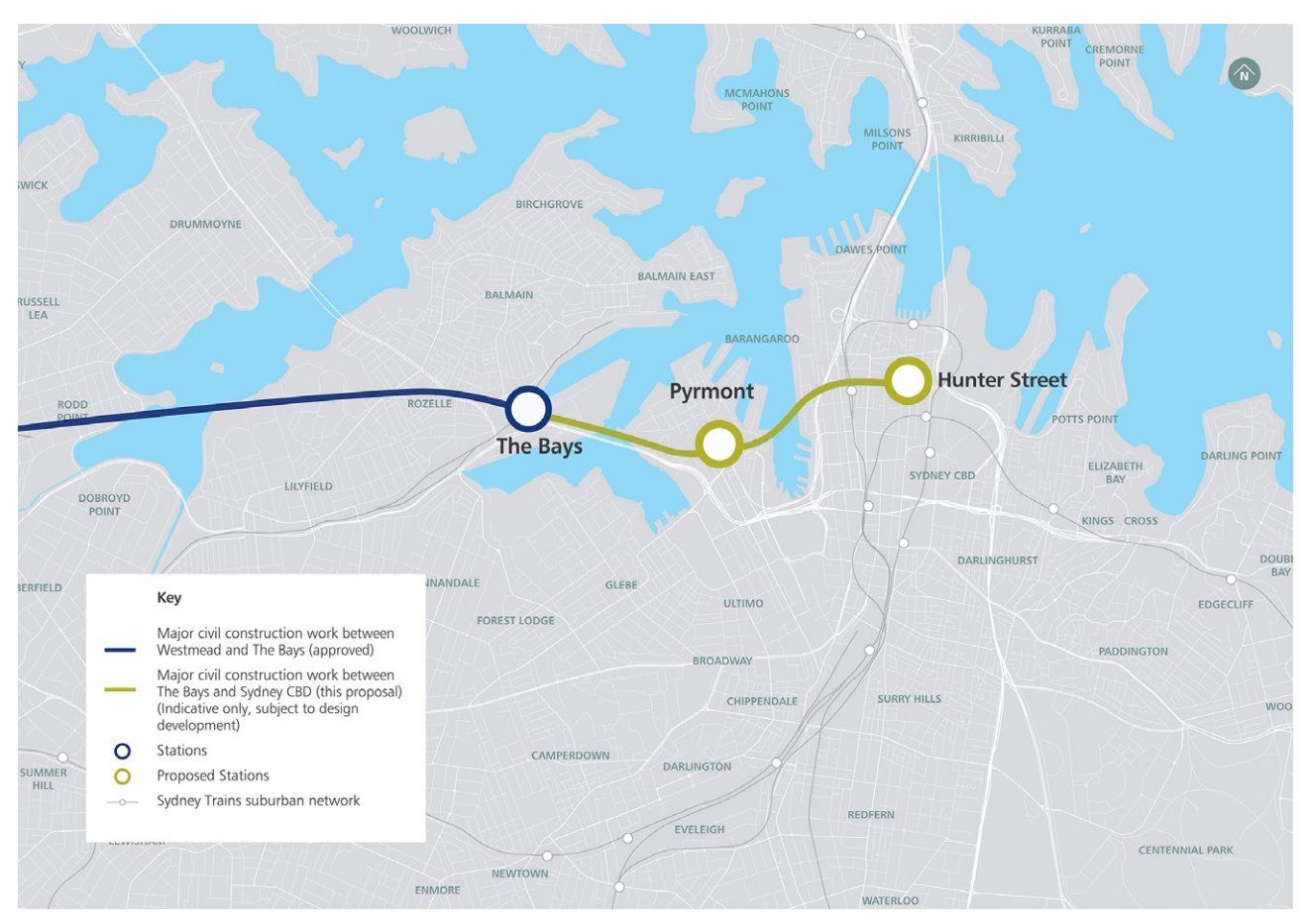
Figure 1-3 Overview of Sydney Metro West between The Bays and Sydney CBD

The proposed major civil construction work between The Bays and Sydney CBD would include: