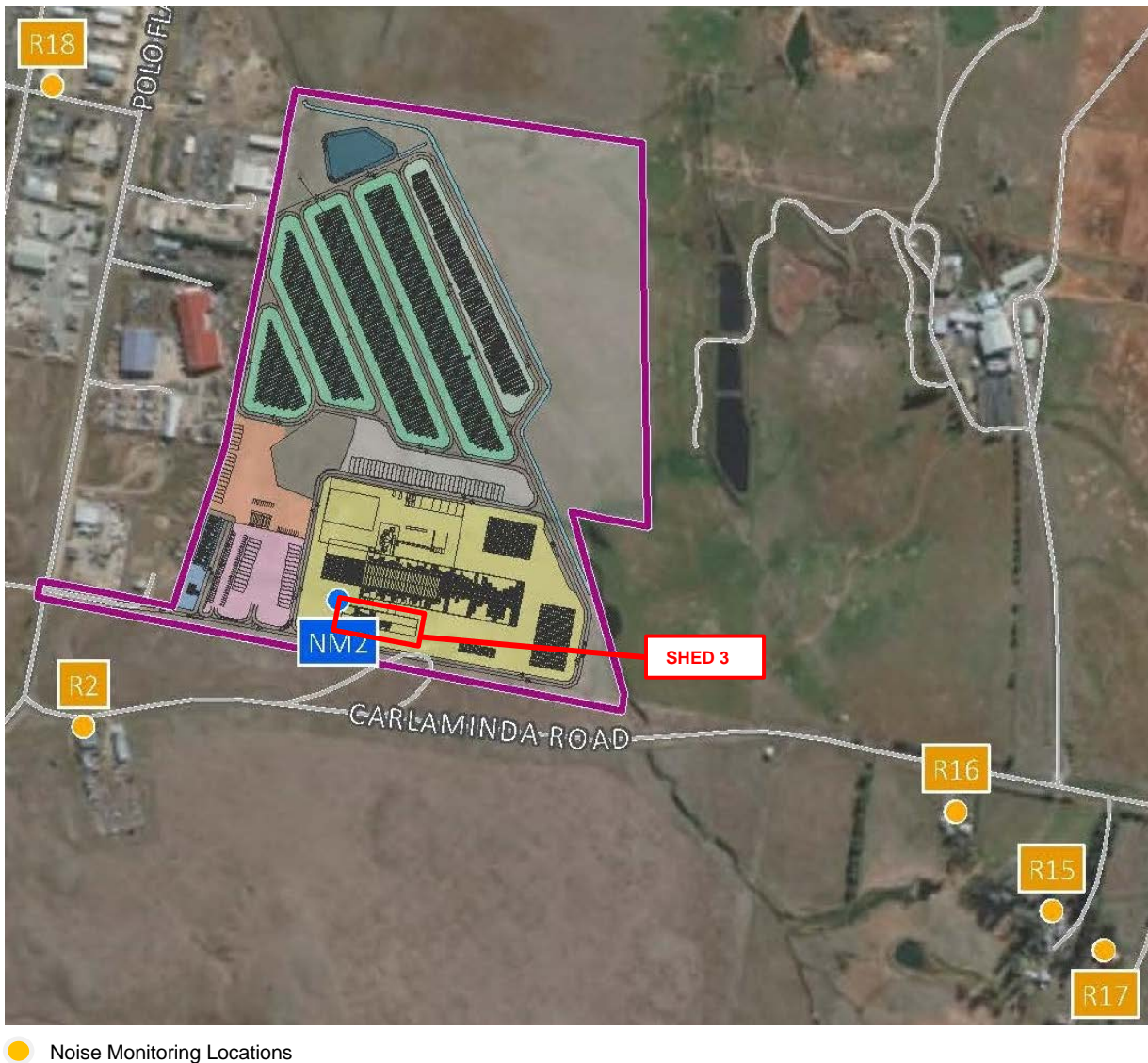
Figure D1: Manual production noise monitoring locations

During the manual production of the project, all works pertaining to manual production will adhere to operational requirements and notably the operational noise limits specified in schedule 3 condition 12. Noise monitoring will be undertaken for works outside of the prescribed construction hours (6pm – 10pm) in accordance with the operational noise criteria.