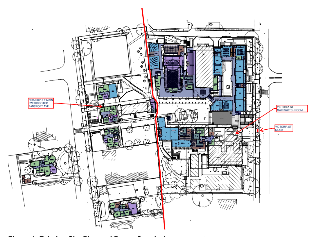
Figure 1. Existing Site Plan and Power Supply Arrangement

The main supply is from Victoria street and the high voltage supply to the kiosk is via underground cables using the specifically installed underground conduits along Victoria Street.