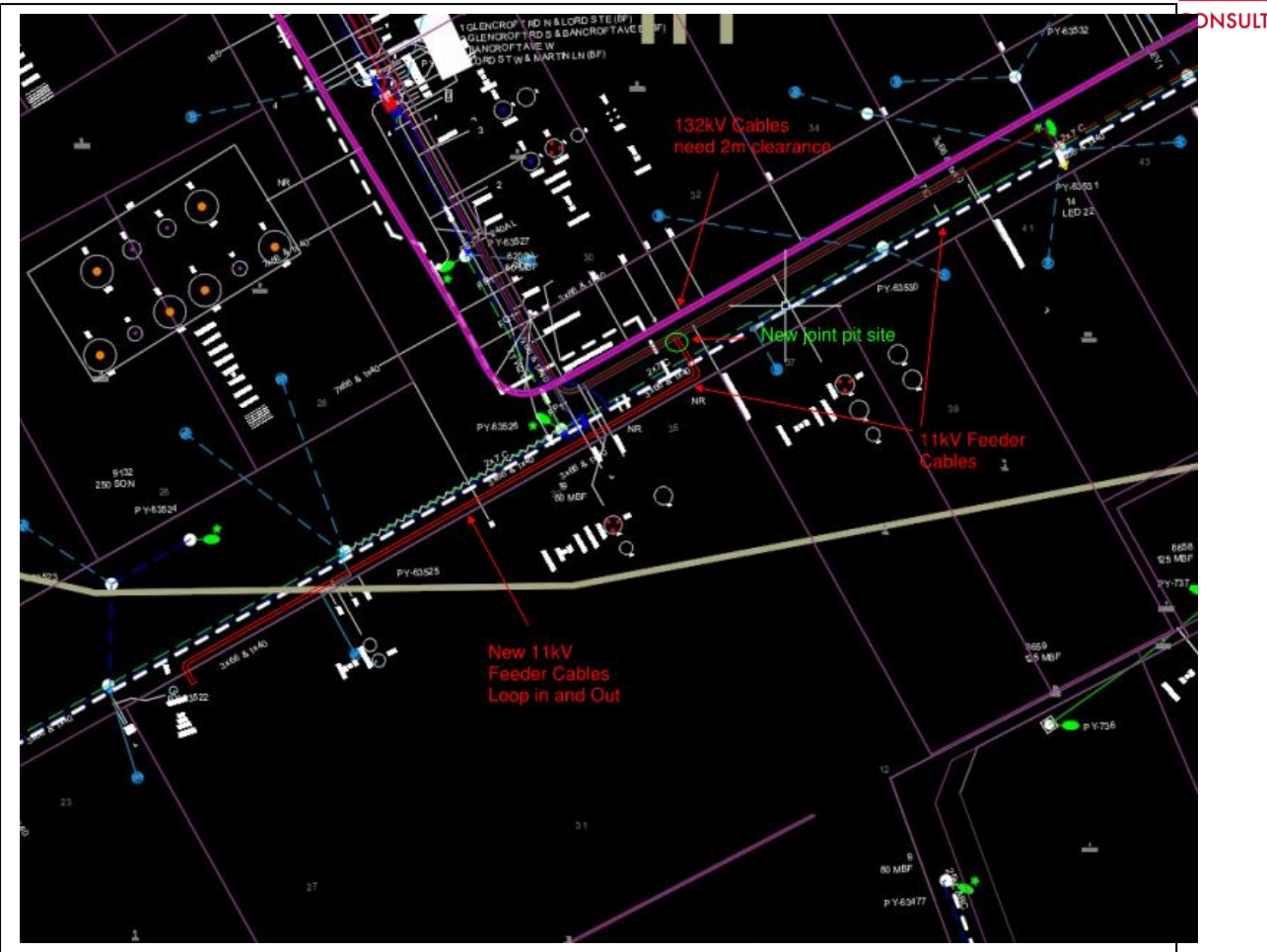
Figure: Existing 132kV and 11kV Underground cables and Proposed Loop in and Out arrangement The figure below shows the 132kV transmission cables and the proposed path for the 11kV cable extension.