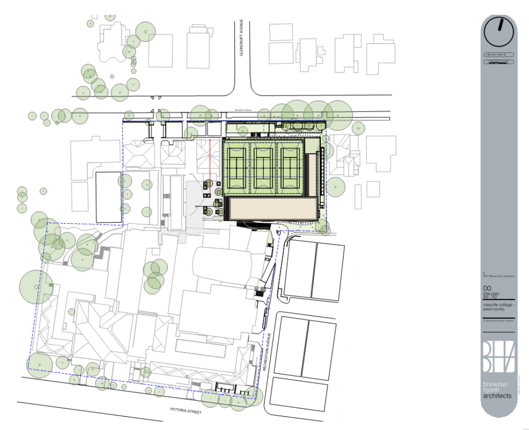
Figure 2. Proposed SWELL Centre Architectural Site Plan.

The SWELL Centre will incorporate two levels of off-street carparking, an 8-lane heated swimming pool with amenities facilities, general learning areas and rooftop tennis courts.