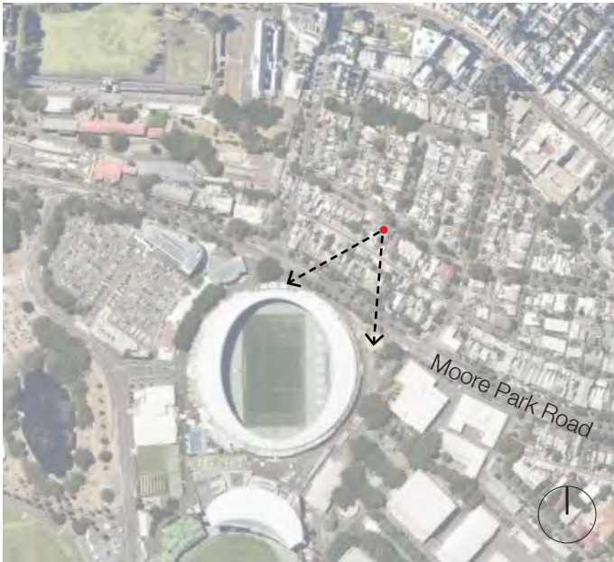
Photo Lens - 24mm