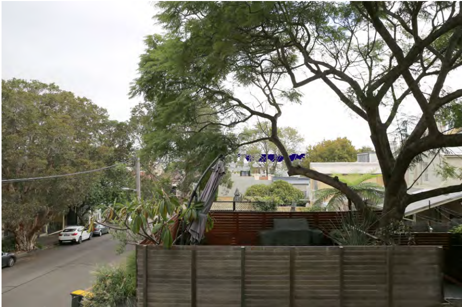
Photomontage of Proposed Building