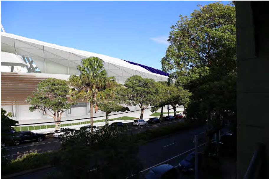
Photomontage of Proposed Building