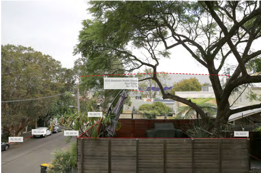
Original Photograph showing Alignment Points