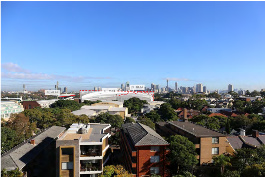
Original Photograph showing Alignment Points