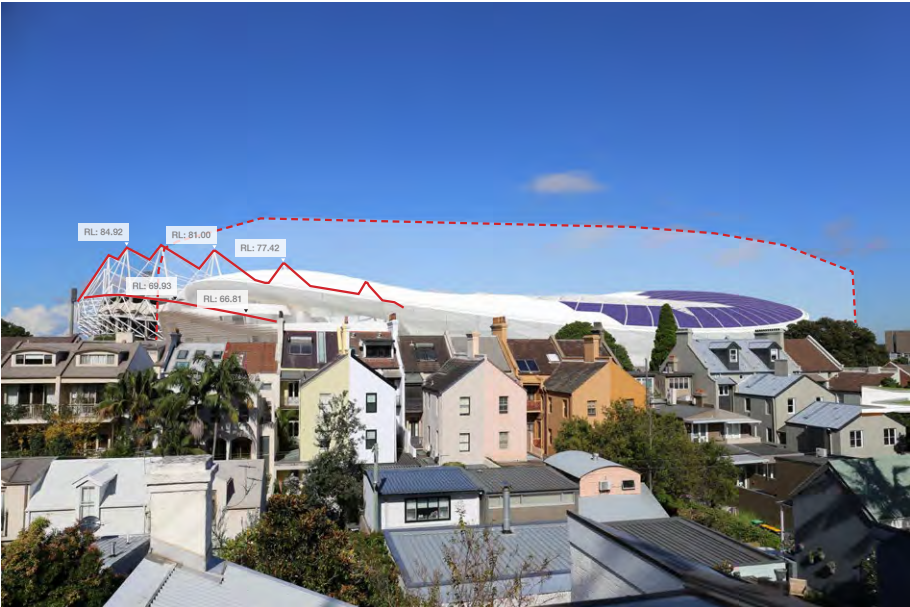
Original Photograph showing Alignment Points