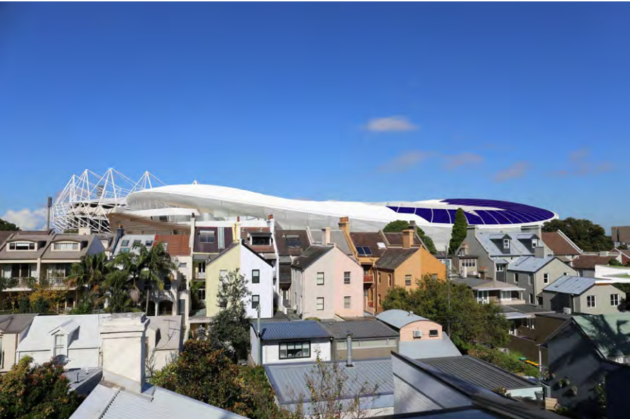
Photo Montage of Proposed Building