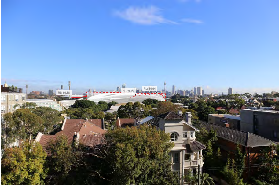
Original Photograph showing Alignment Points