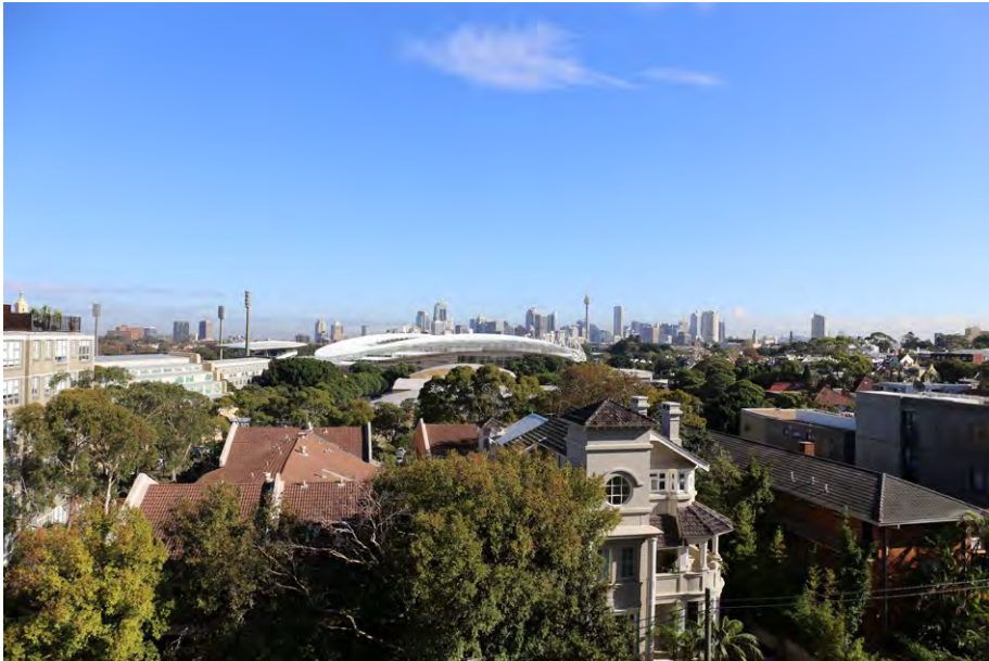
Photomontage of Proposed Building