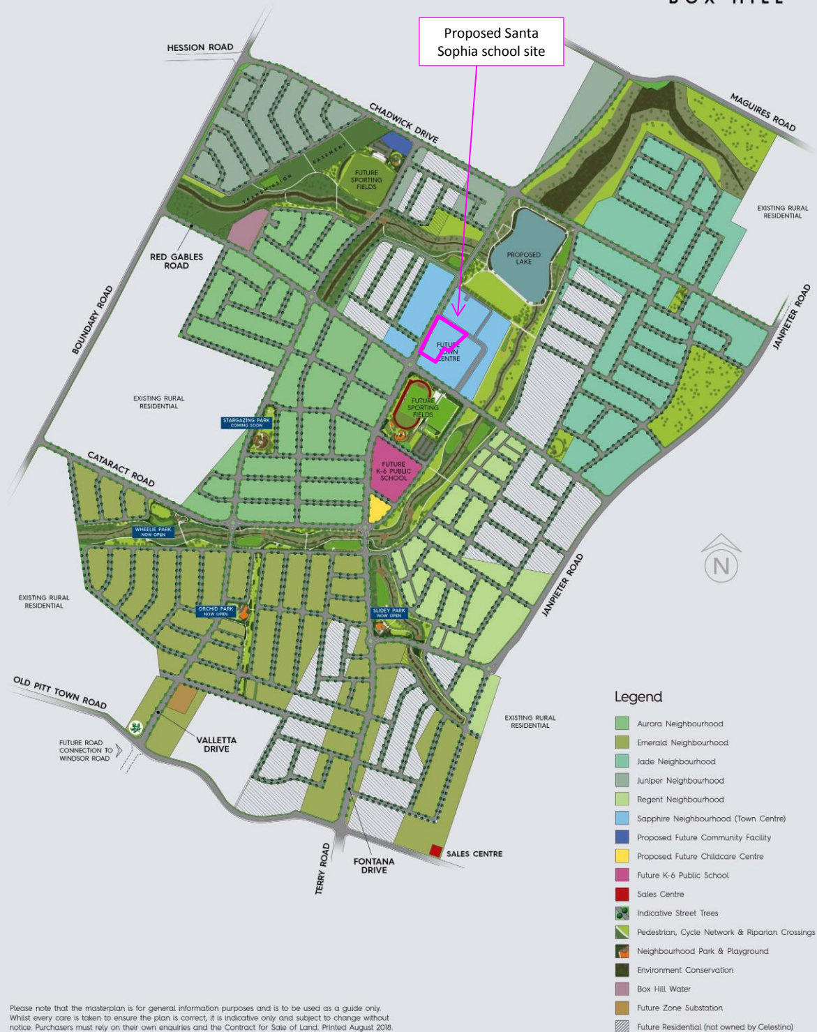
Figure 1. Location of proposed school site within The Gables Masterplan