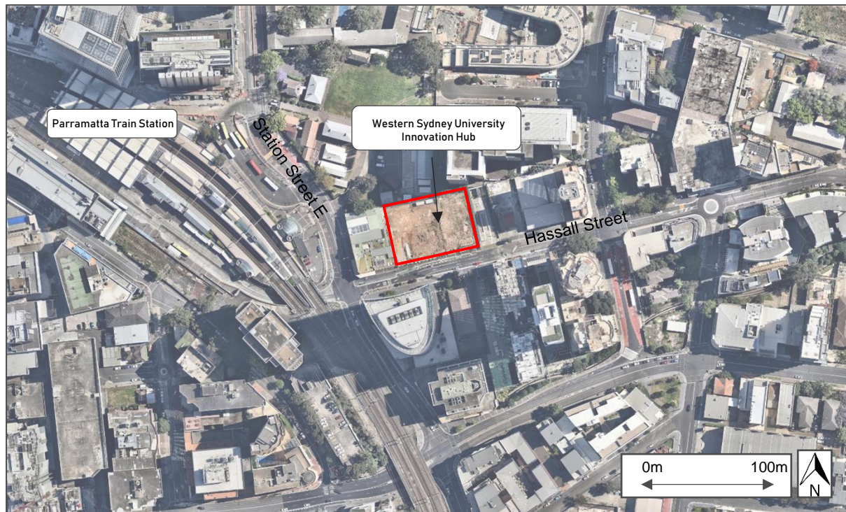
Figure 1 | Local Context Map

The Western Sydney University Innovation Hub is located at 2-6 Hassall Street, Parramatta at the south-eastern portion of the Parramatta CBD as depicted in Figure 1 . The site is an amalgamation of three allotments legally described as Lot 22 in DP 608861, Lot 62 in DP 1006215 and Lot 7 in DP128820 with a combined area of 2,647sqm and a frontage of 62m along Hassall Street.