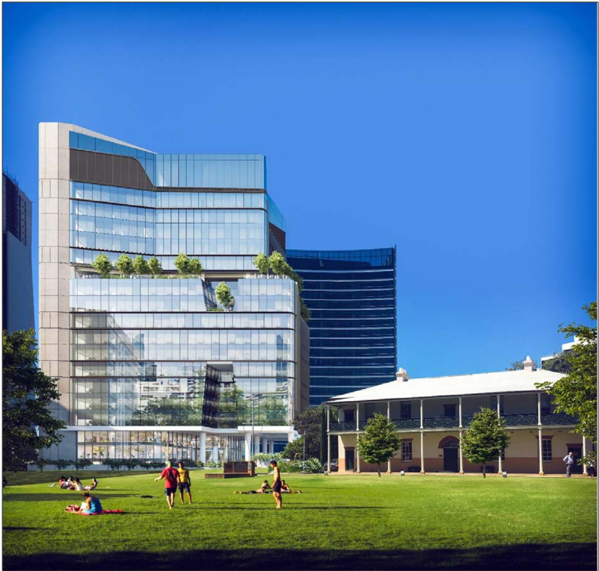
Figure 4 | Northern Perspective of Modified Façade and Parapet (Source: Modification Report)