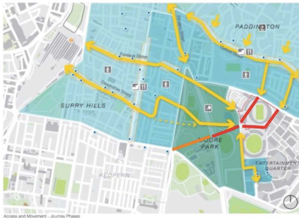
Urban Design Report Access and Movement Diagram, marked up to show informal link to Redfern (orange) and new links to and through the site required (red).