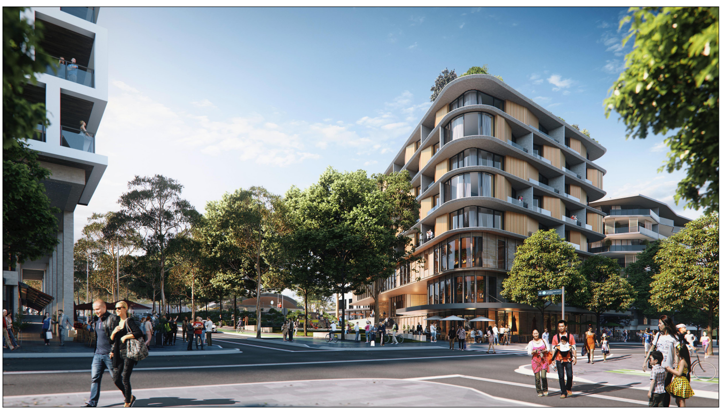
View looking across the public park from Conferta Avenue with the Metro station in the distance. The streets, through-site links and public open space have been carefully considered to create a legible and walkable fine grain development.