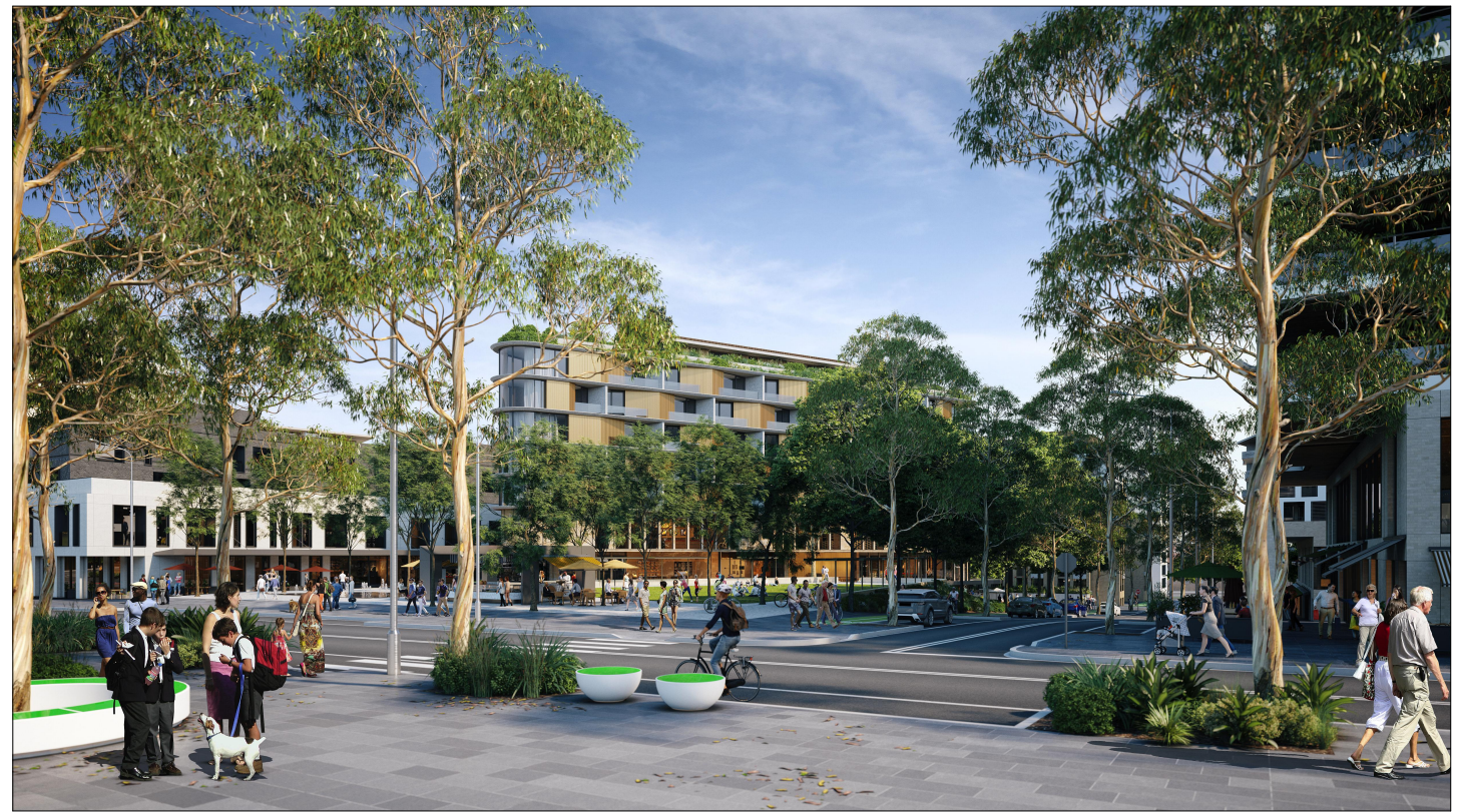
View looking towards the public park across Themeda Avenue. The park together with the Metro Station and commercial/retail precinct forms the focal point for the proposed community.