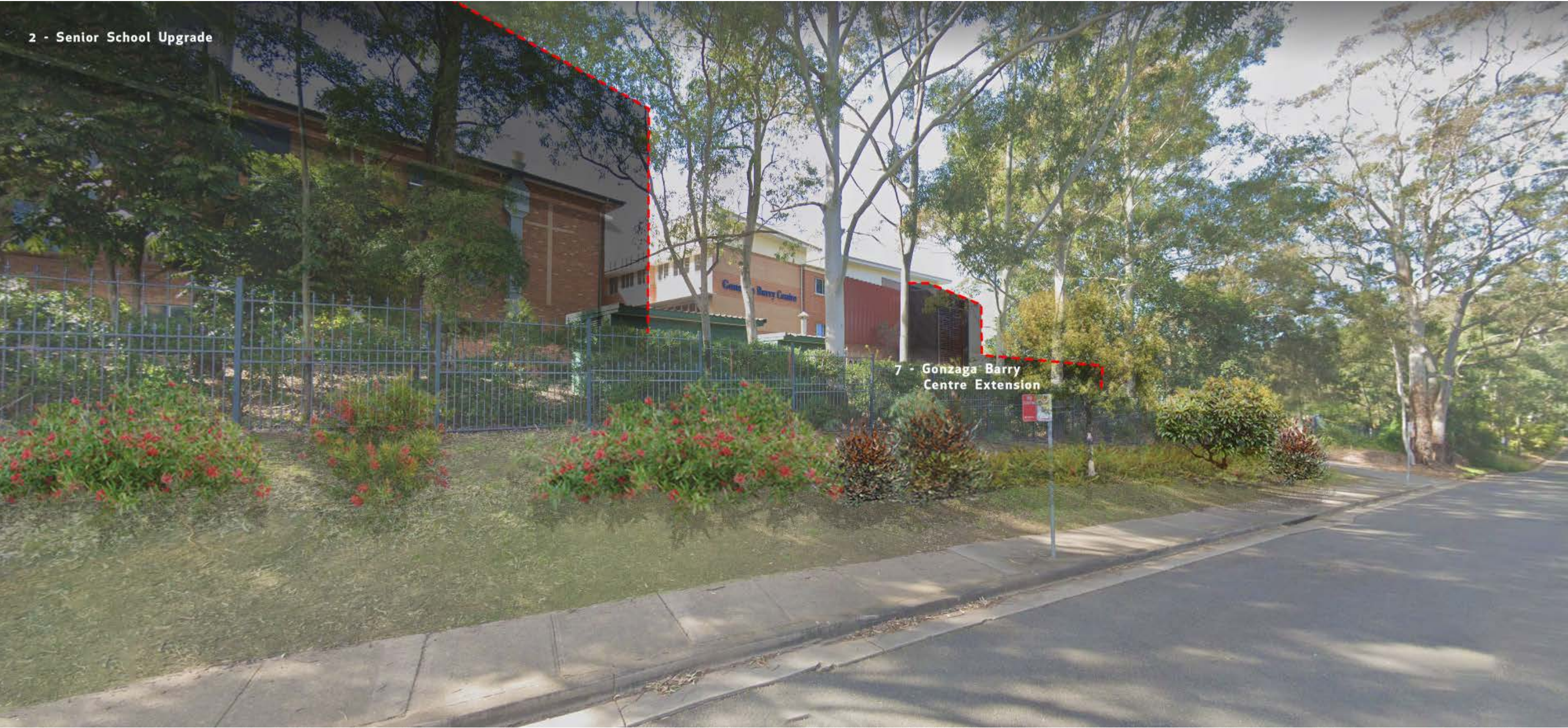
2 - Senior School Upgrade