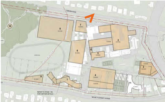
7 - Gonzaga Barry Centre Extension