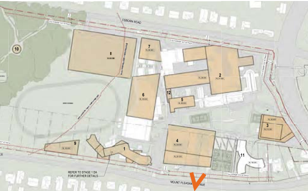
MASTERPLAN VIEW - 06 EXISTING