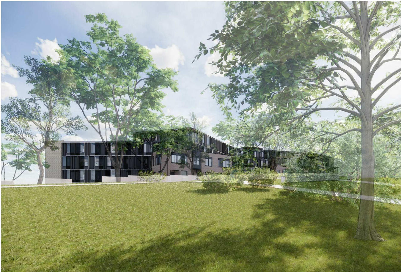
9. VIEW FROM FRONT OF 43 MOUNT PLEASANT AVENUE TOWARDS ENVELOPE 1 - BOARDING HOUSE