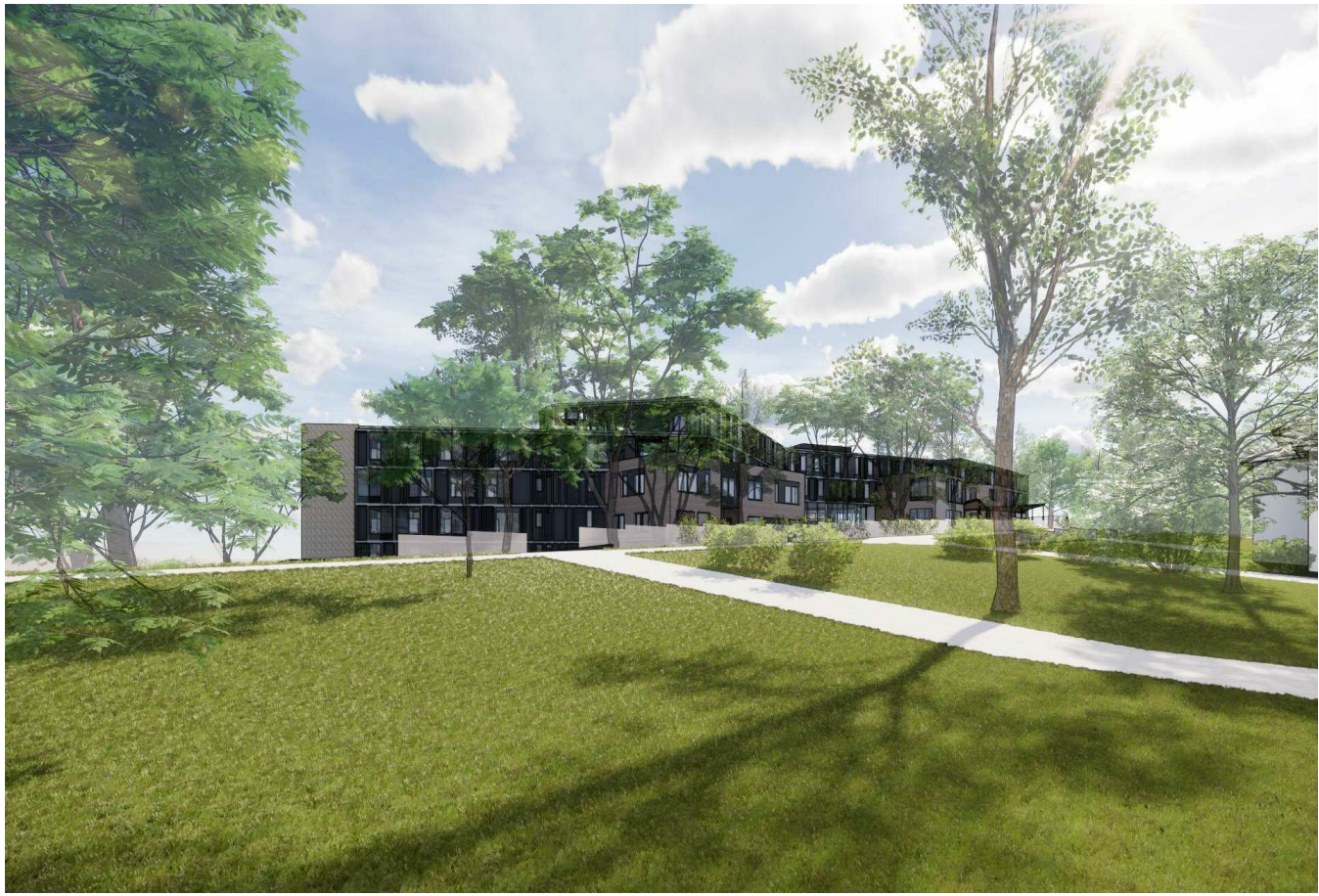
10. VIEW FROM FRONT OF 45 MOUNT PLEASANT AVENUE TOWARDS ENVELOPE 1 - BOARDING HOUSE