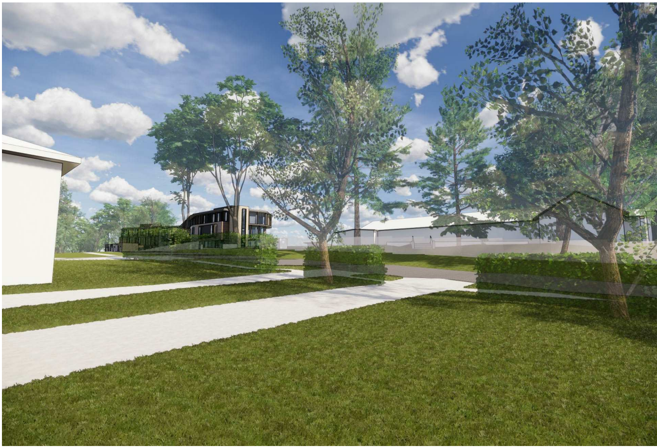
1. VIEW FROM FRONT OF 27 MOUNT PLEASANT AVENUE TOWARDS ENVELOPE 1 - BOARDING HOUSE