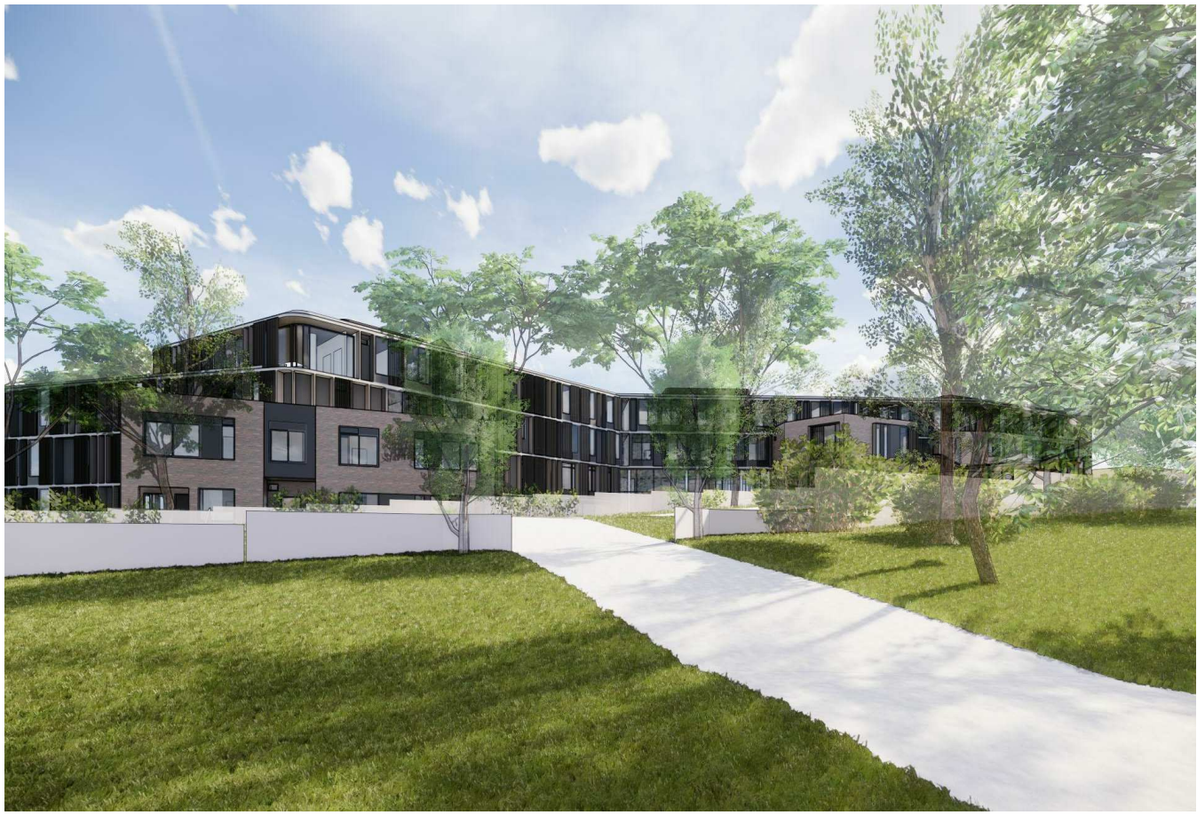
8. VIEW FROM FRONT OF 41 MOUNT PLEASANT AVENUE TOWARDS ENVELOPE 1 - BOARDING HOUSE