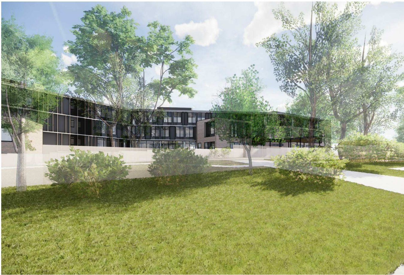
7. VIEW FROM FRONT OF 39 MOUNT PLEASANT AVENUE TOWARDS ENVELOPE 1 - BOARDING HOUSE