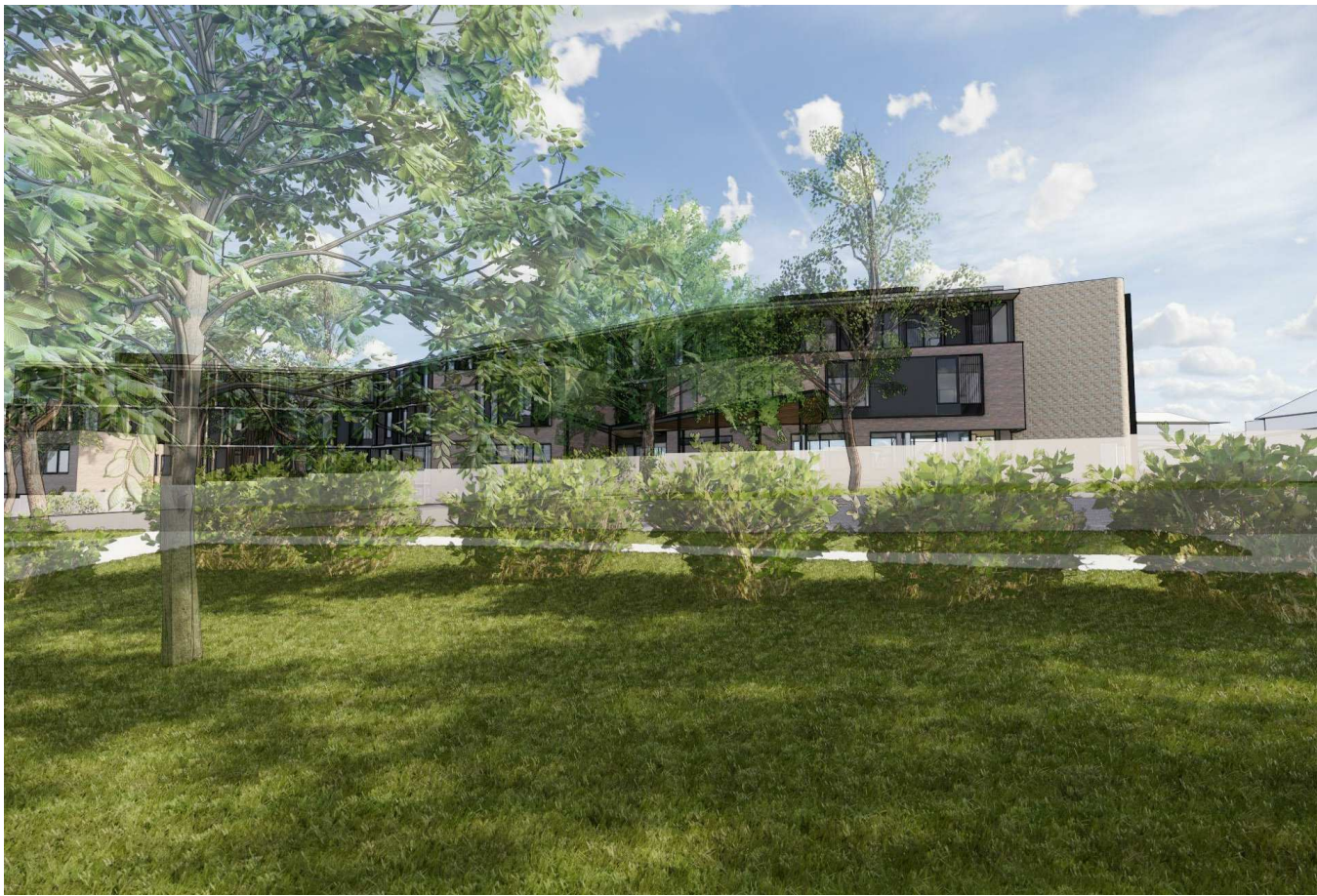
5. VIEW FROM FRONT OF 35 MOUNT PLEASANT AVENUE TOWARDS ENVELOPE 1 - BOARDING HOUSE