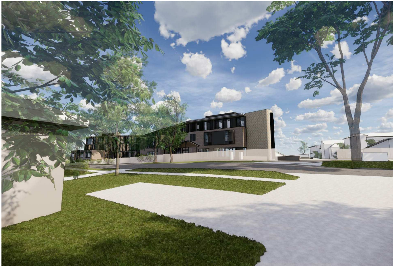
4. VIEW FROM FRONT OF 33 MOUNT PLEASANT AVENUE TOWARDS ENVELOPE 1 - BOARDING HOUSE