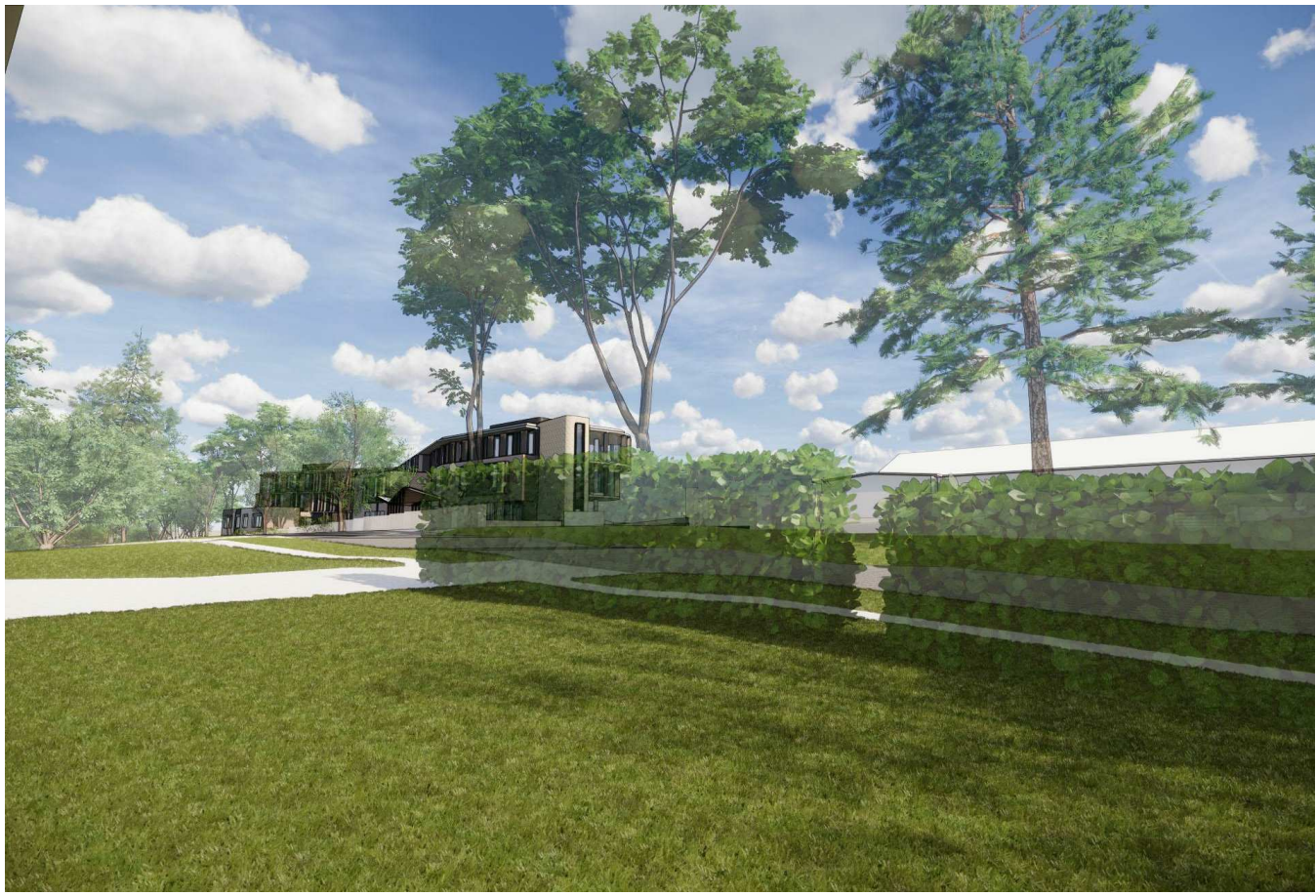
2. VIEW FROM FRONT OF 29 MOUNT PLEASANT AVENUE TOWARDS ENVELOPE 1 - BOARDING HOUSE