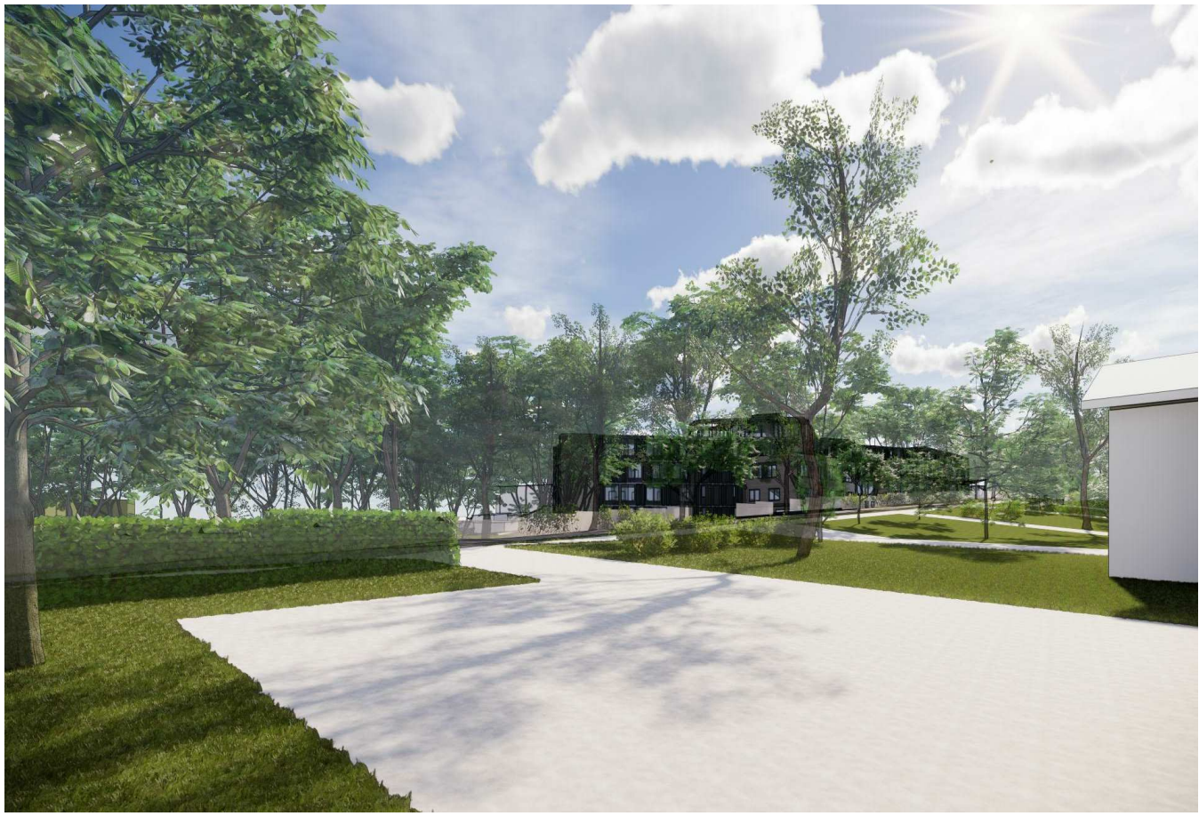
12. VIEW FROM FRONT OF 49 MOUNT PLEASANT AVENUE TOWARDS ENVELOPE 1 - BOARDING HOUSE