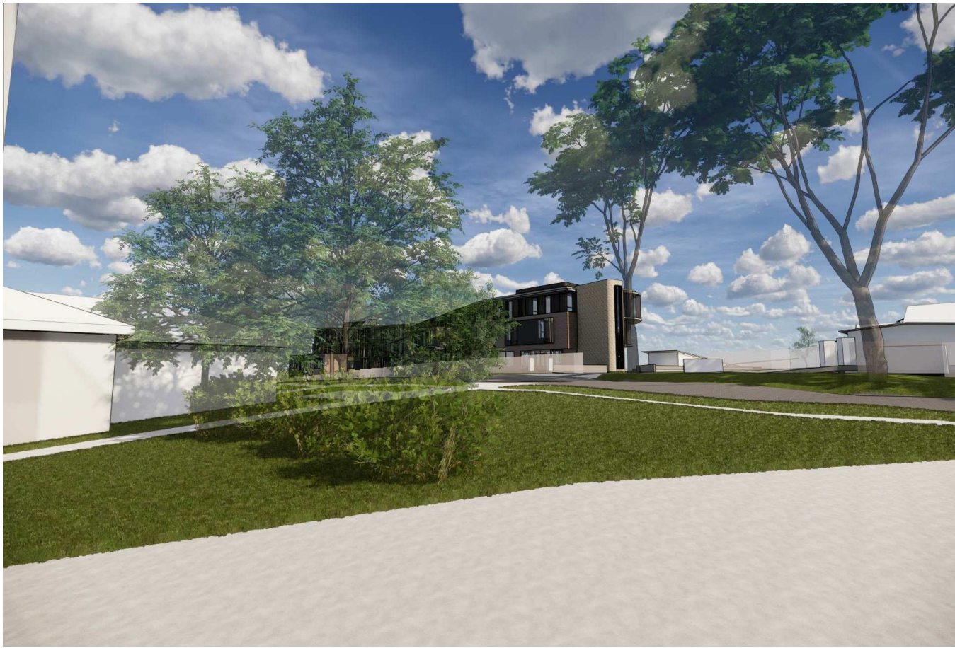
3. VIEW FROM FRONT OF 31 MOUNT PLEASANT AVENUE TOWARDS ENVELOPE 1 - BOARDING HOUSE