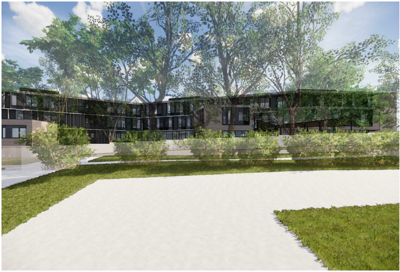
6. VIEW FROM FRONT OF 37 MOUNT PLEASANT AVENUE TOWARDS ENVELOPE 1 - BOARDING HOUSE