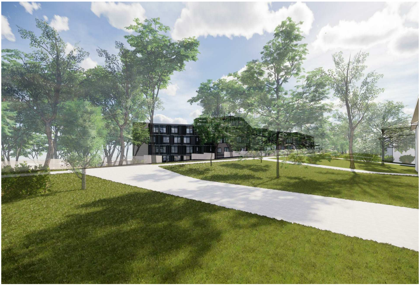
11. VIEW FROM FRONT OF 47 MOUNT PLEASANT AVENUE TOWARDS ENVELOPE 1 - BOARDING HOUSE