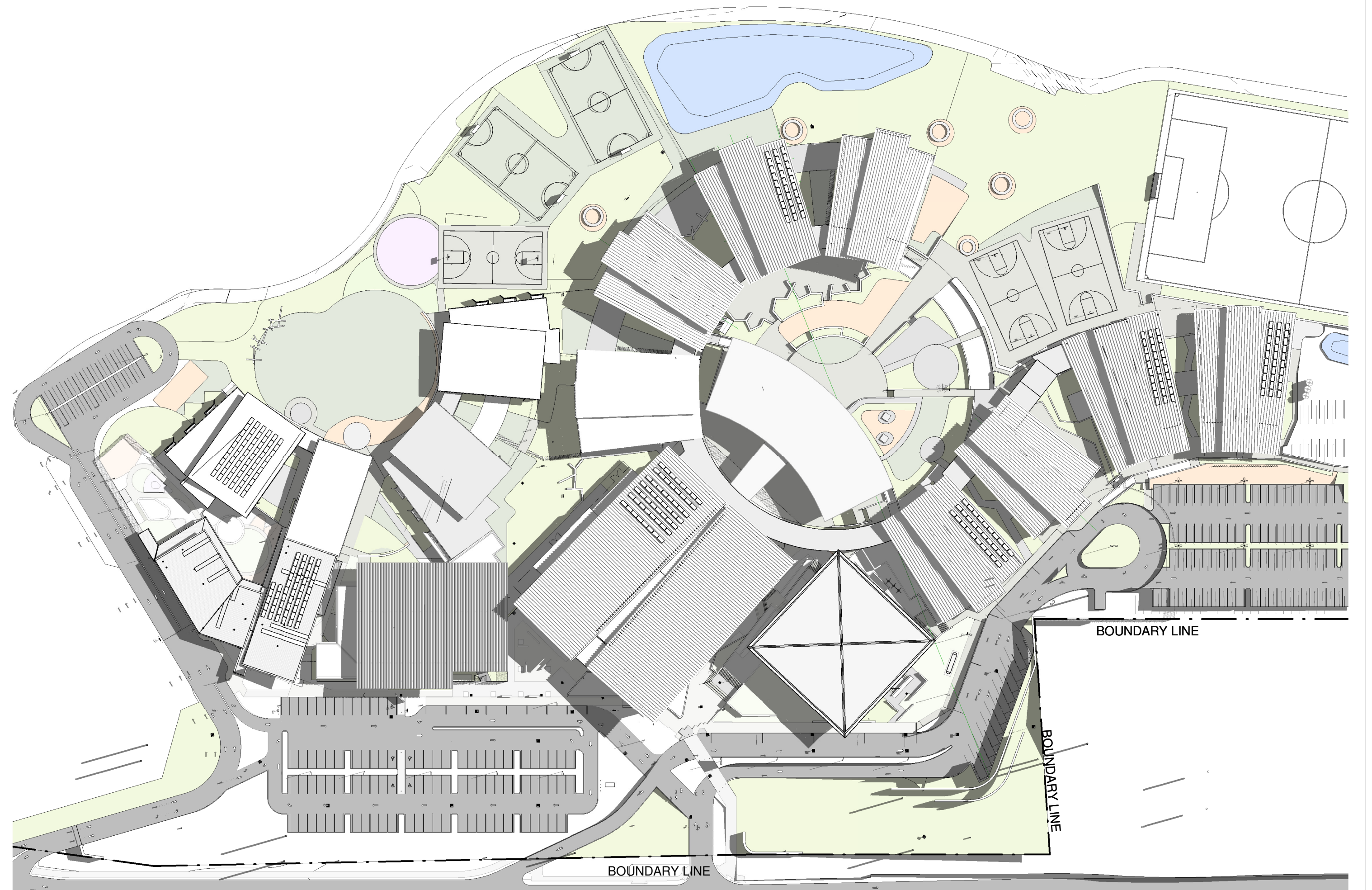
2 SUN STUDY - JUNE 21ST - 12PM 04_0001 SCALE 1:1000