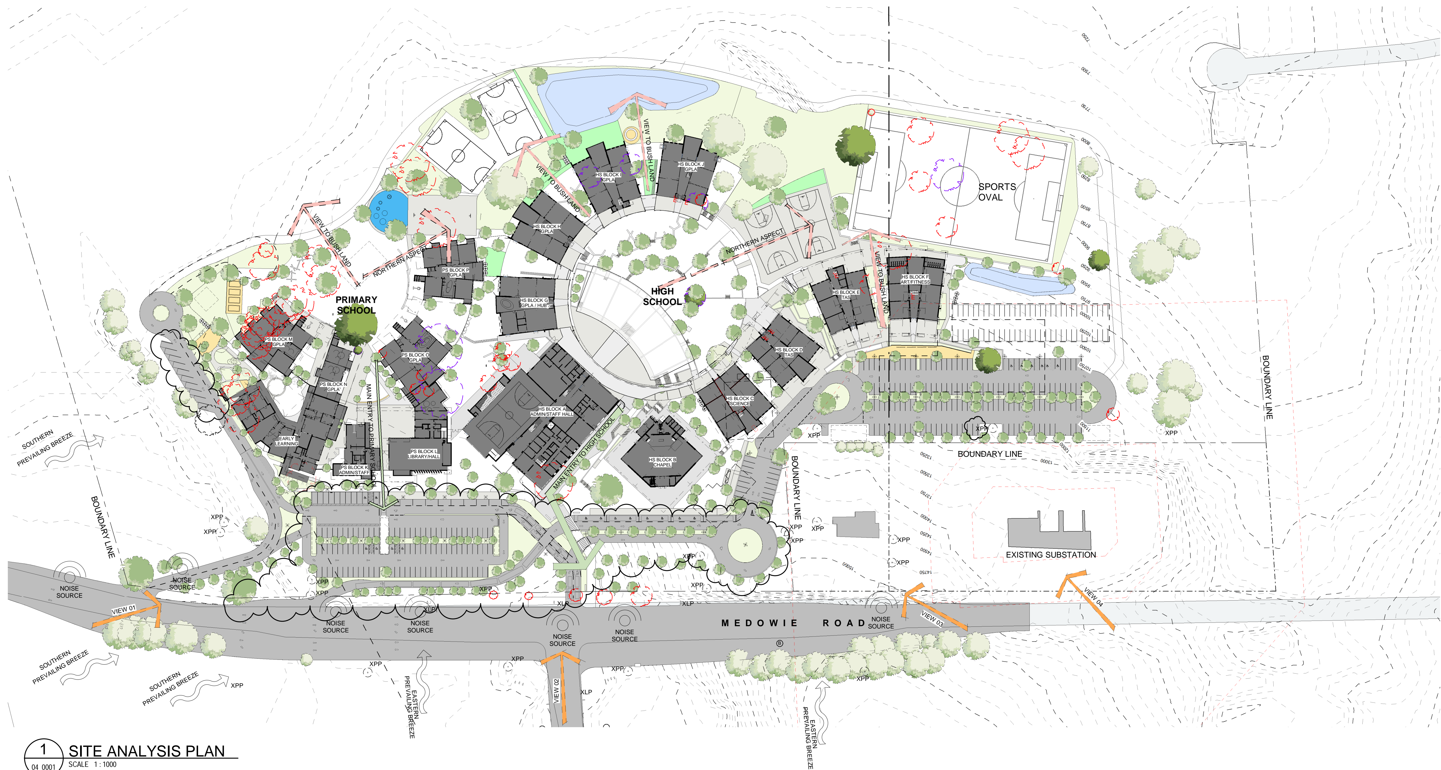
1 SITE ANALYSIS PLAN 04_0001 SCALE 1:1000

NOTE: ALL TREES INSIDE THE BOUNDARY LINE HAVE BEEN SURVEYED. REFER TO SURVEY B1662DET - 1 - B ALL THE TREES OUTSIDE THE BOUNDARY LINE HAVE BEEN TAKEN FROM A GOOGLE EARTH PHOTO.