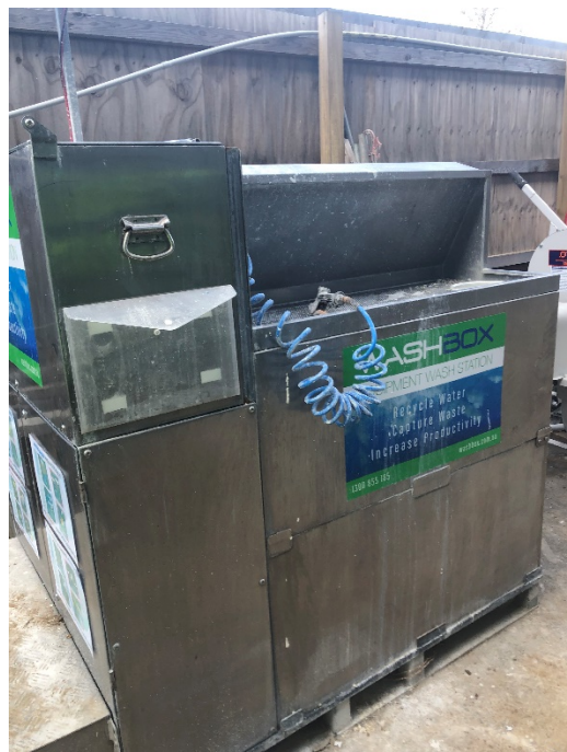
Plate 2 and 3: Washboxes for paint and other items that separates solids and recycles water