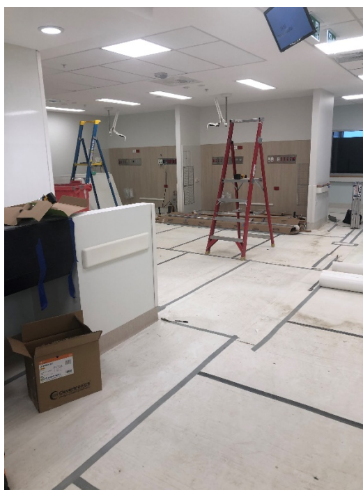
Plate 6 and 7: Internal photos showing near complete fit out