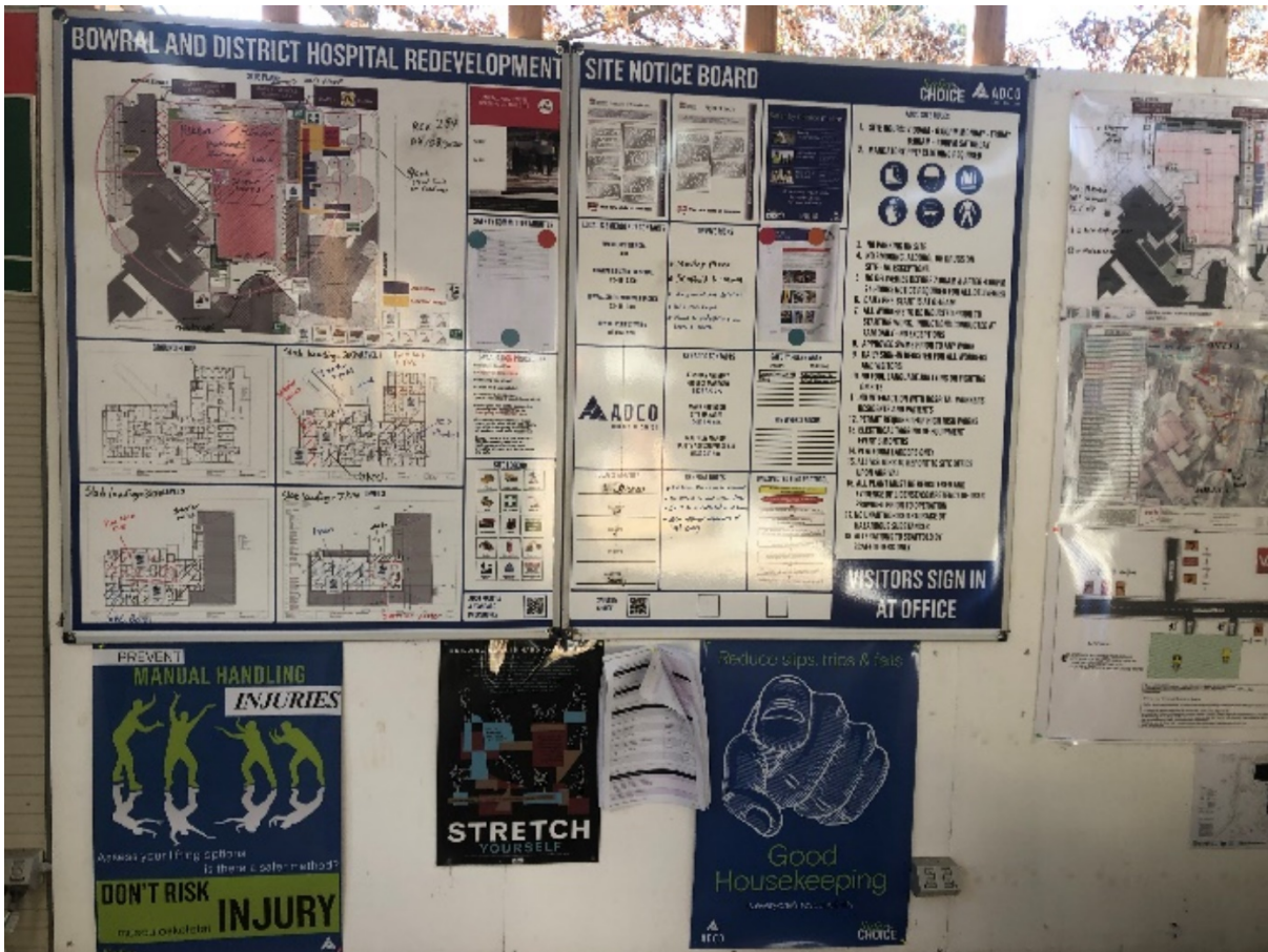
Plate 1: Notice board showing traffic control plan, site layout, safety and other site information