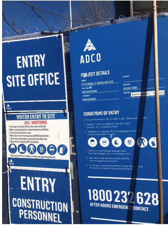
Plate 9: Site notification board