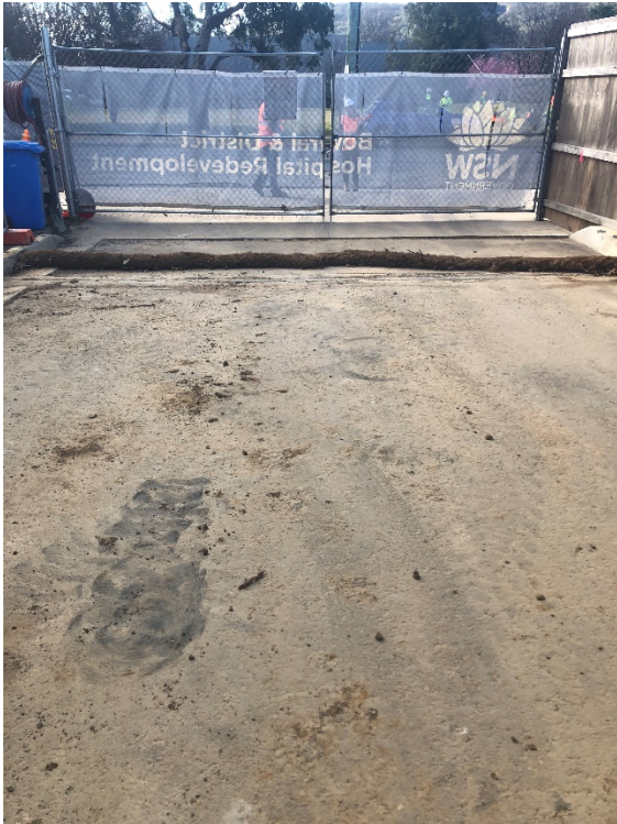
Plate 8: Gated Entry point with Coir log for sediment control