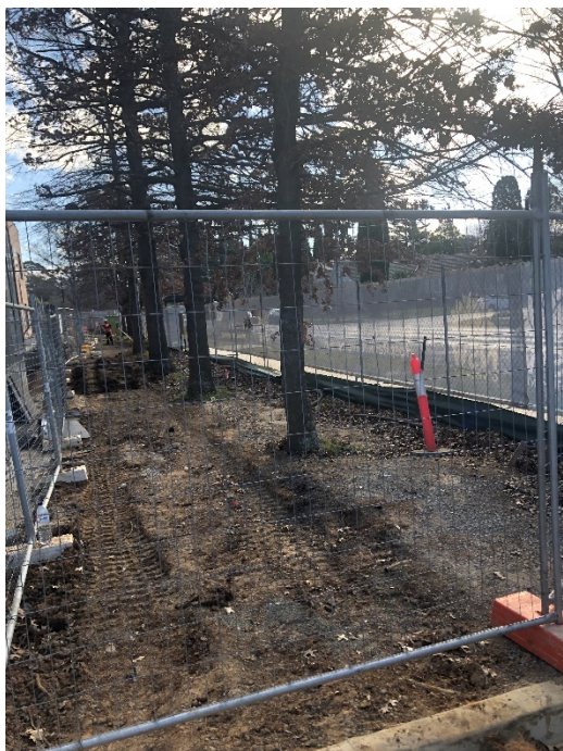
Plate 4: Tree Protection Zone