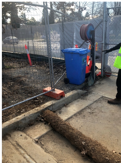
Plate 5: Coir log for sediment control and spill kit