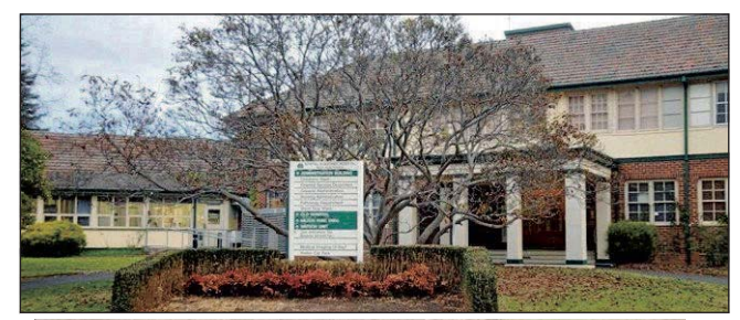
There will be five information sessions about Bowral Hospital redevelopment next week.