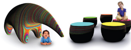
SPECIAL FURNITURE PAEDS WAITING AREA