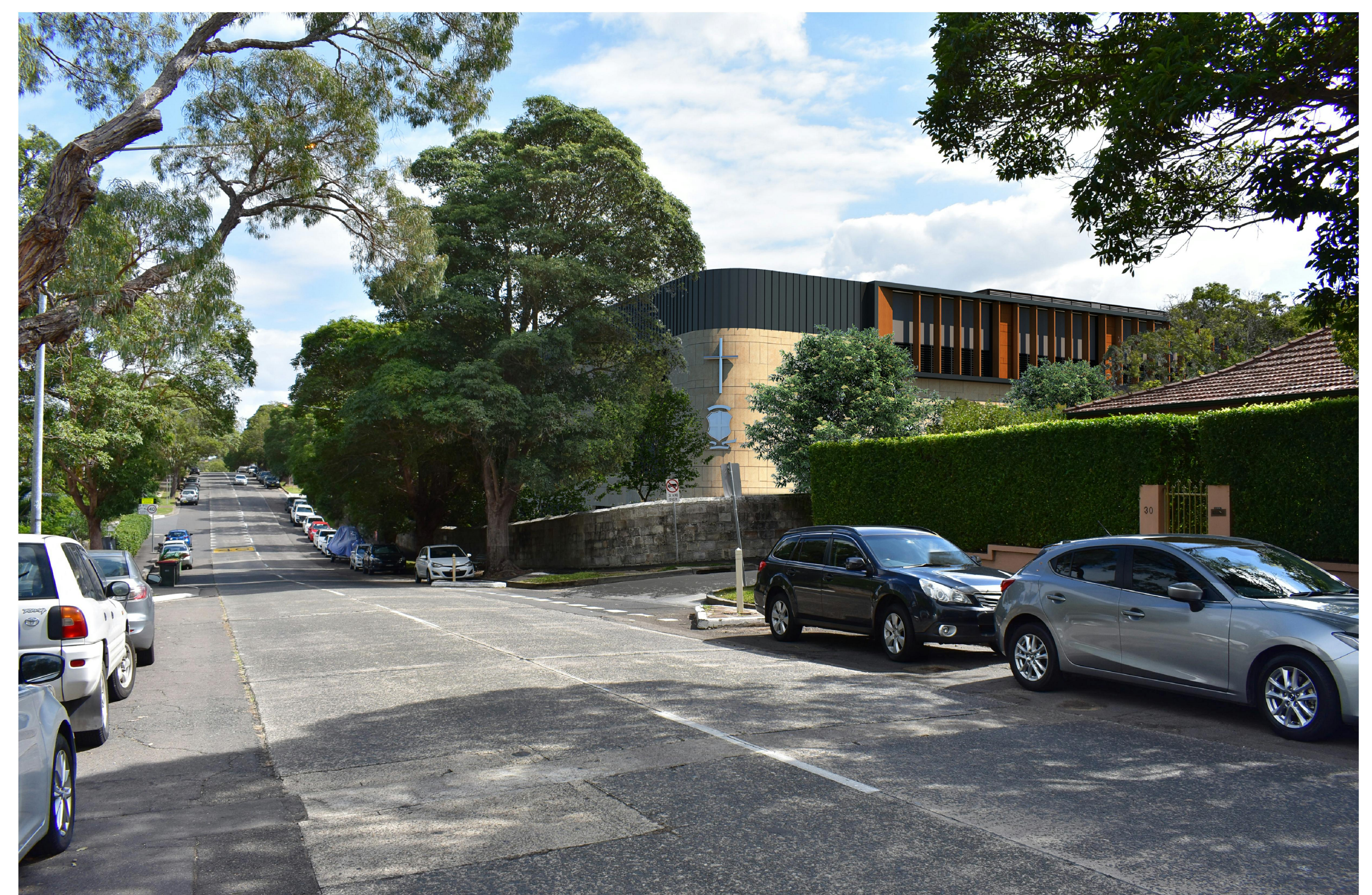
VIEW E_PROPOSED