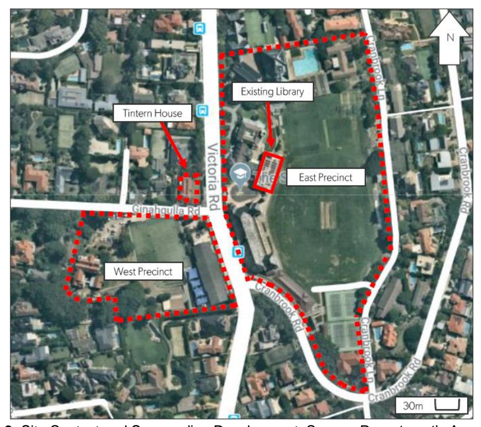
Figure 2: Site Context and Surrounding Development.