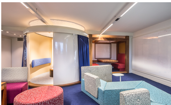
Figure 3 Collaborative learning environments integrated with the Library