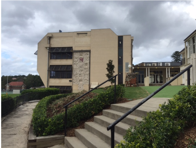
Figure 1 The existing Library. Building detracts from the heritage precinct.