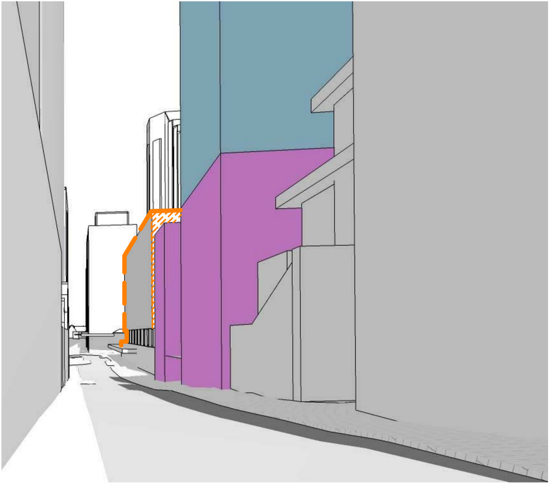
VIEW 2 PROPOSED INDICATIVE CONCEPT DESIGN