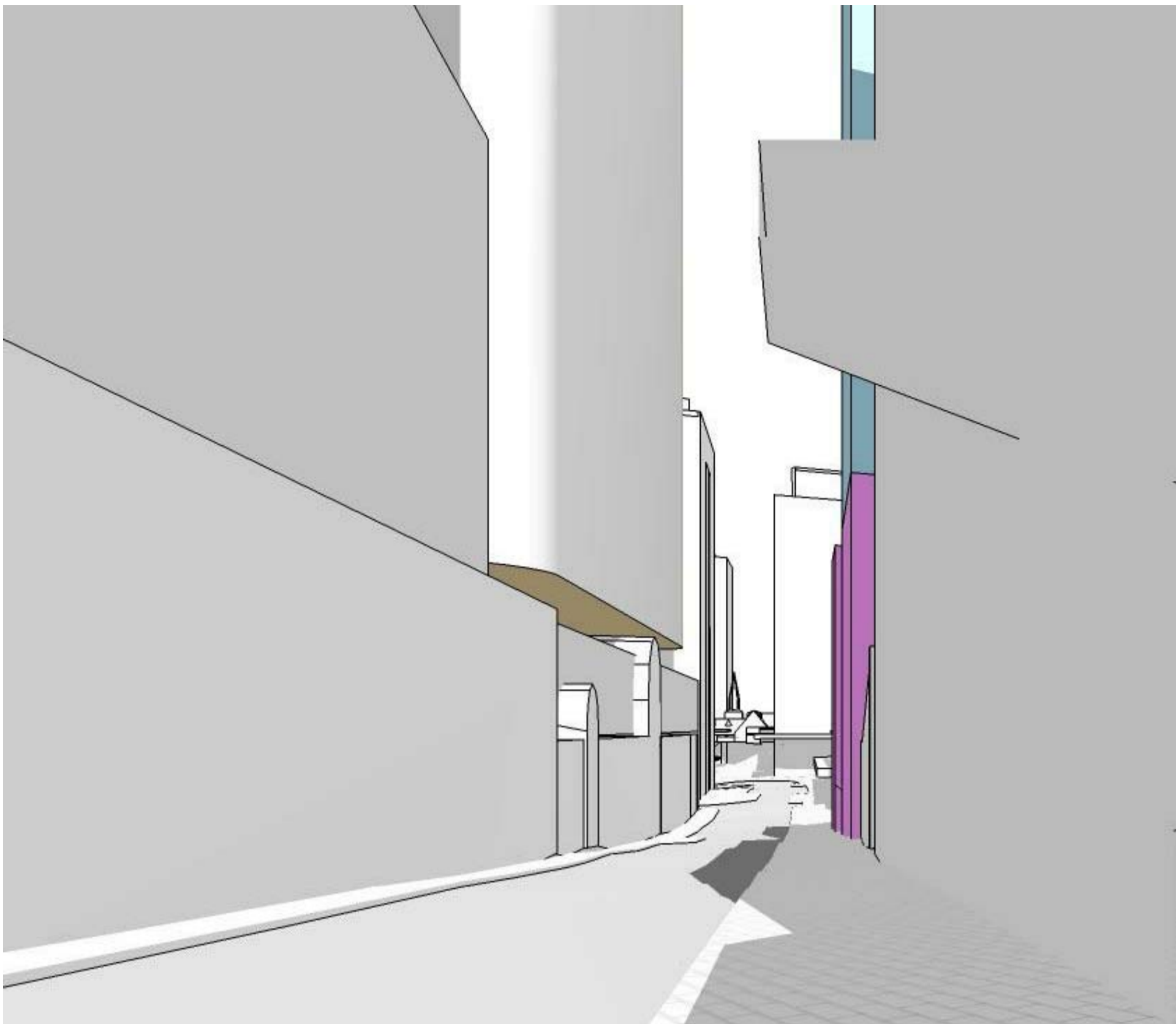
VIEW 1 PROPOSED INDICATIVE CONCEPT DESIGN