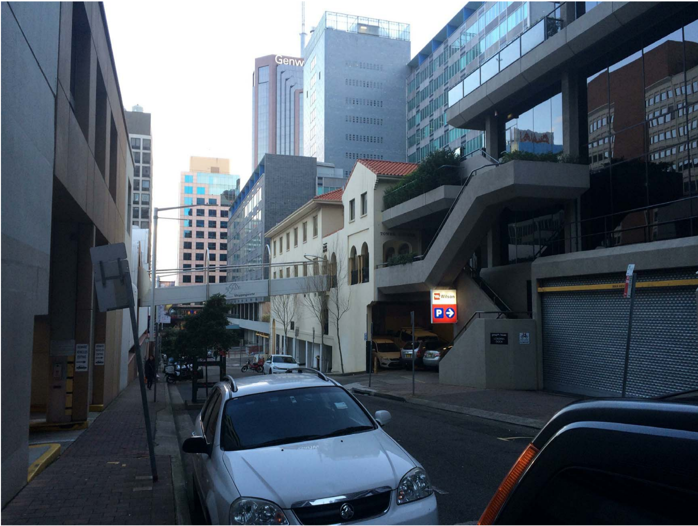
VIEW 2 - PHOTO OF PREVIOUS BUILDING LOOKING DOWN DENISON STREET