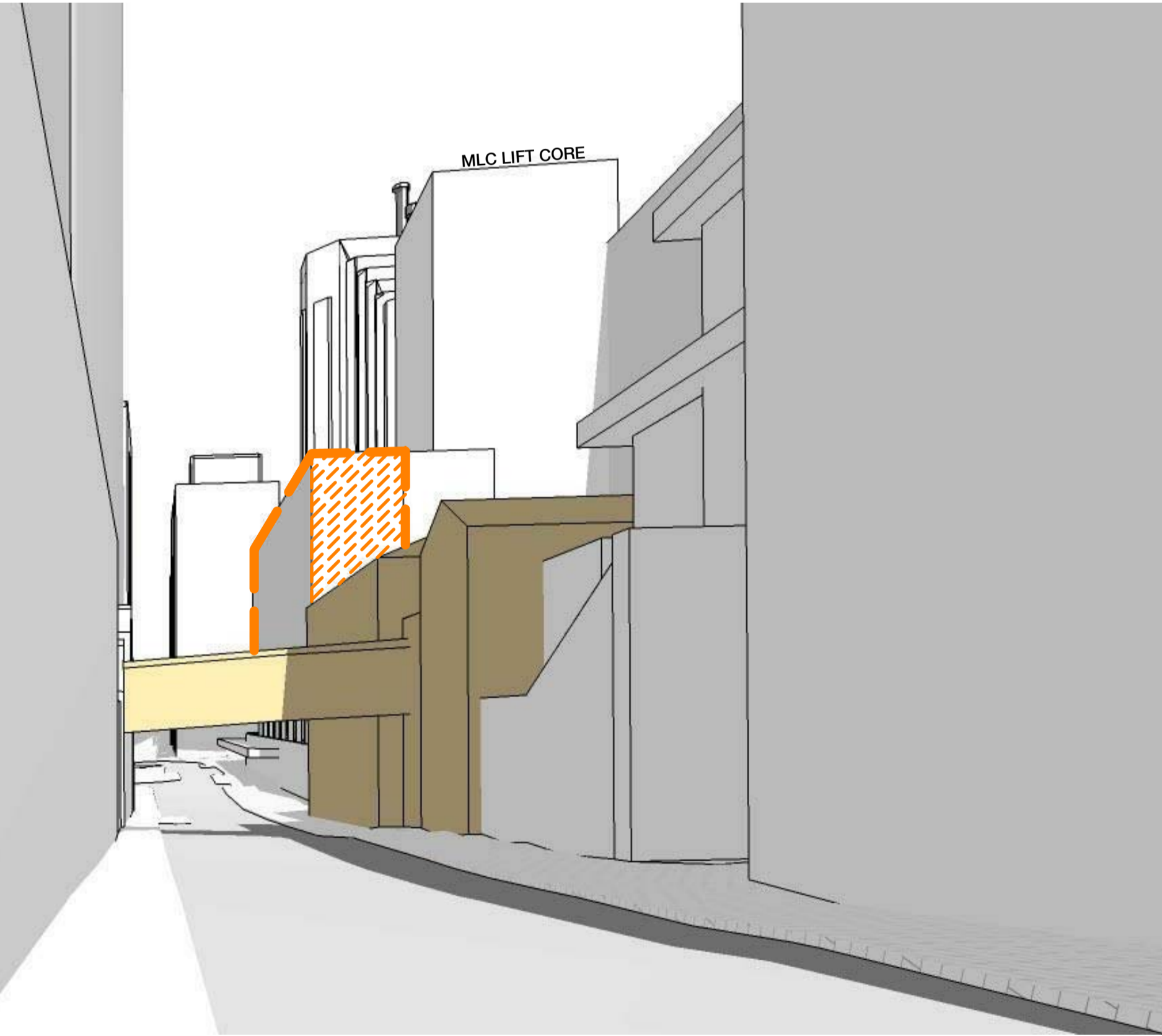
VIEW 2 PREVIOUS BUILDING - PRE-CSSI DEMOLITION