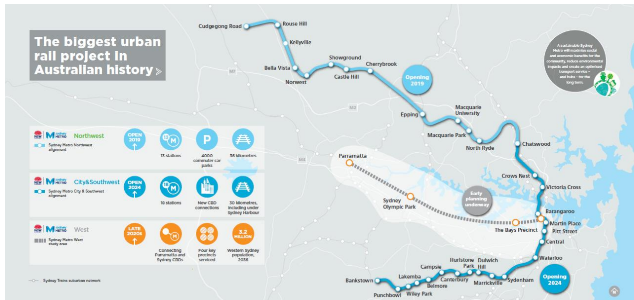
Figure 1: Sydney Metro alignment

Sydney Metro is a standalone railway that will deliver 31 metro stations and more than 66 kilometres of new metro rail between Rouse Hill in Sydney's North West and Bankstown in Sydney's South West.