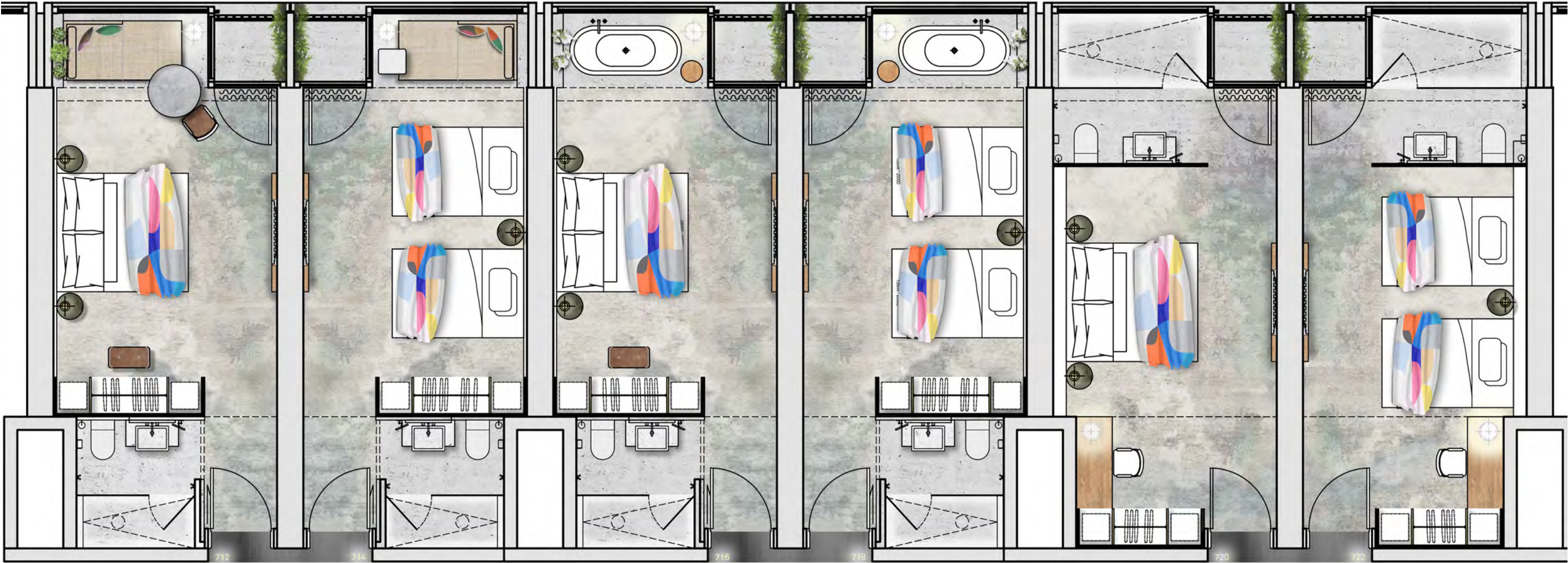
Standard King Room 26 sqm (Option 01 Type A)