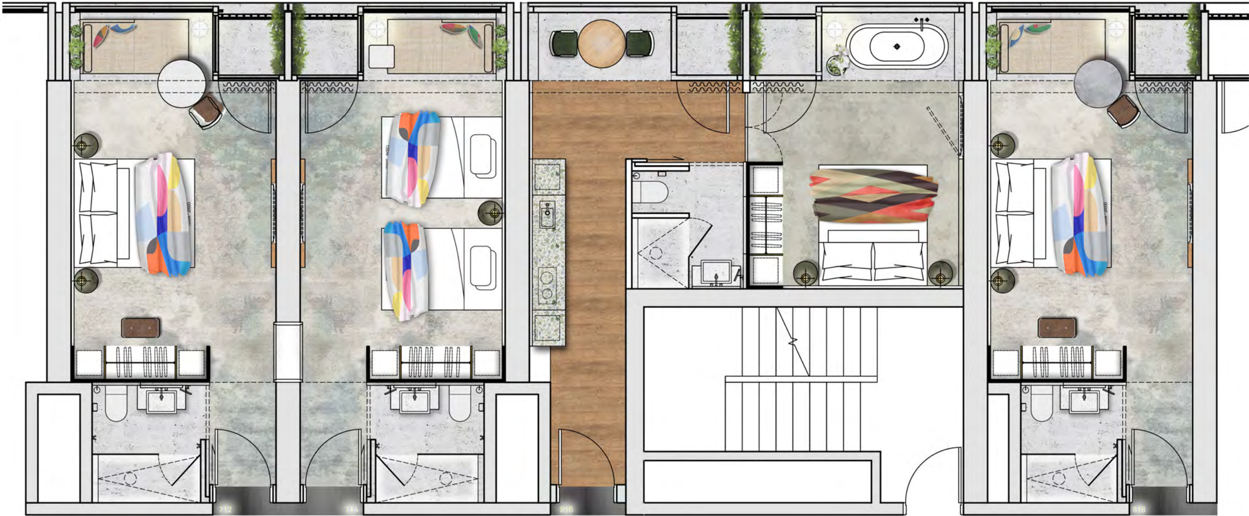
Standard King Room 26 sqm (Dual Key Type A)