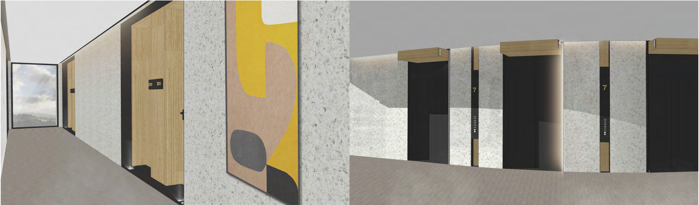
Guest Journey to Suites