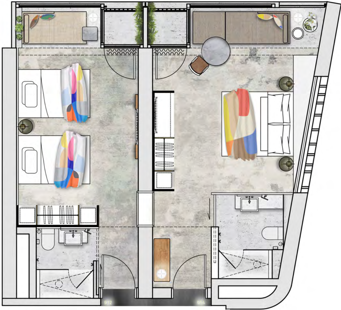
Standard Twin Room 26 sqm (Dual Key Type A)