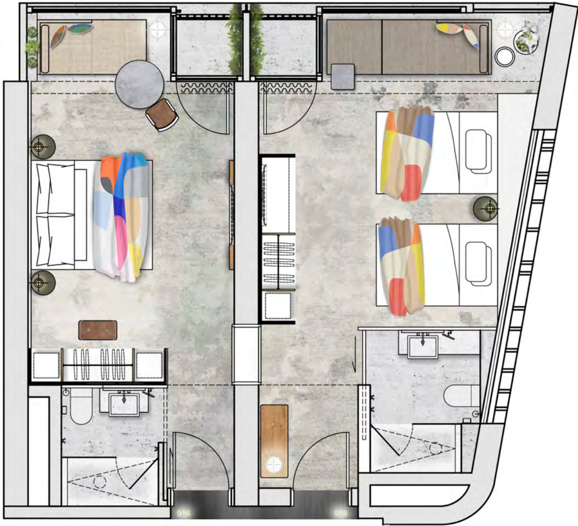
Standard King Room 26 sqm (Dual Key Type A)