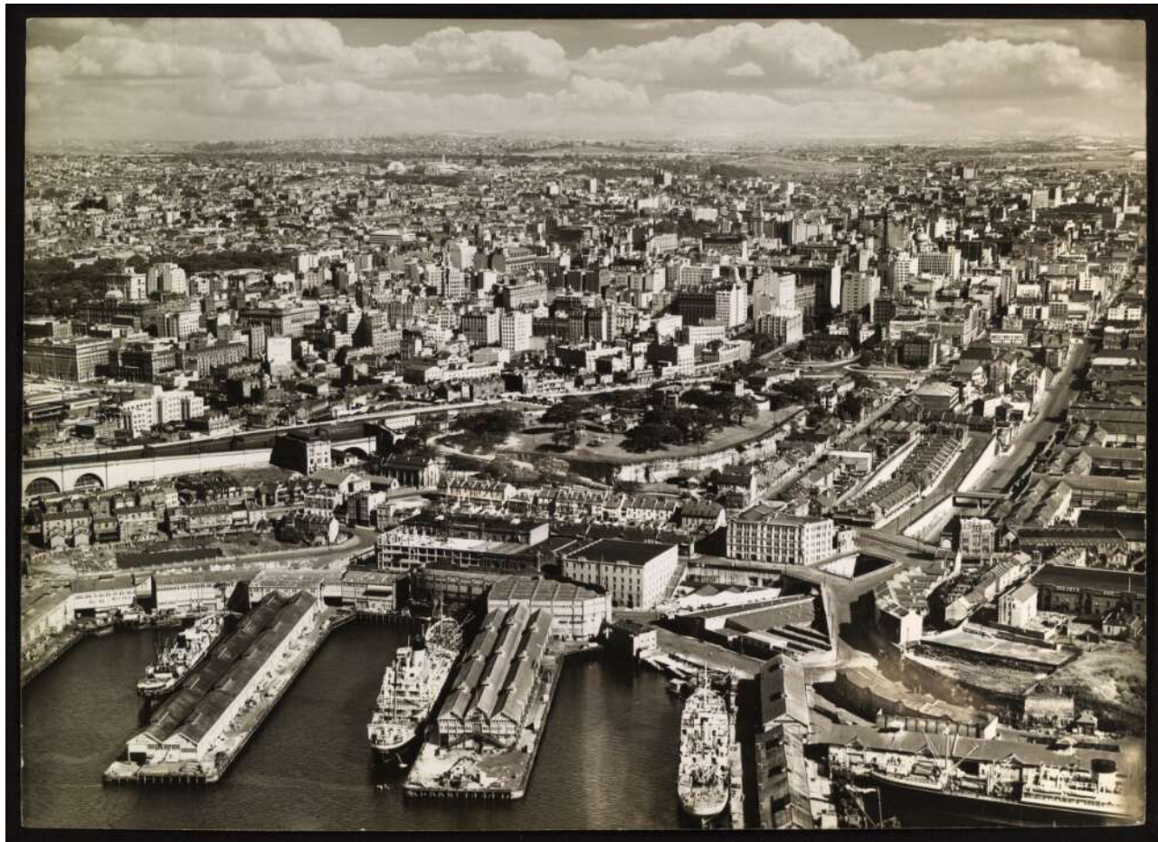
Figure 5: Sydney, the city facing Walsh Bay