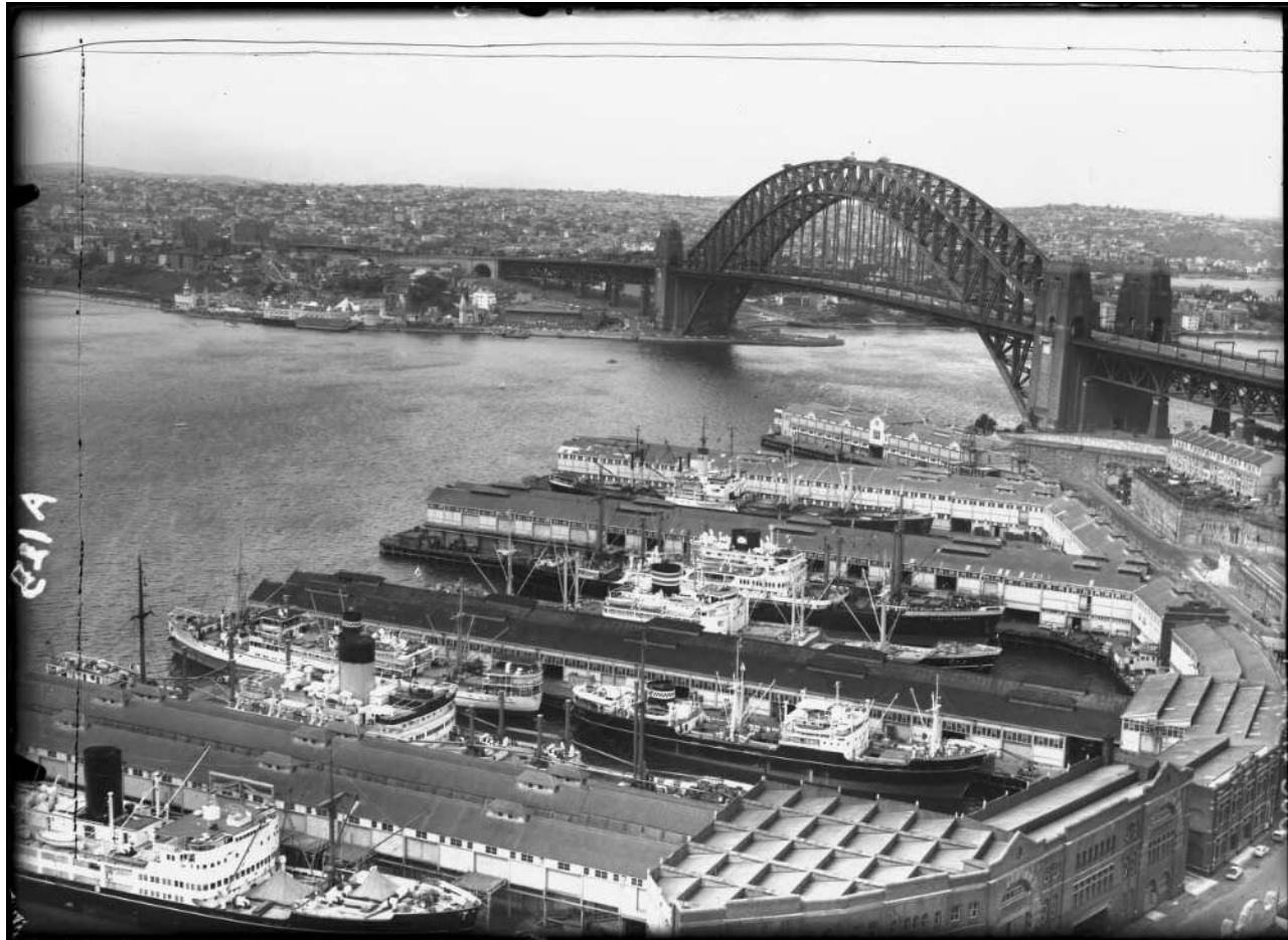
Figure 6: Bridge from Walsh Bay, Sydney Harbour Bridge, Walsh Bay wharves and ships, Luna Park, Sydney