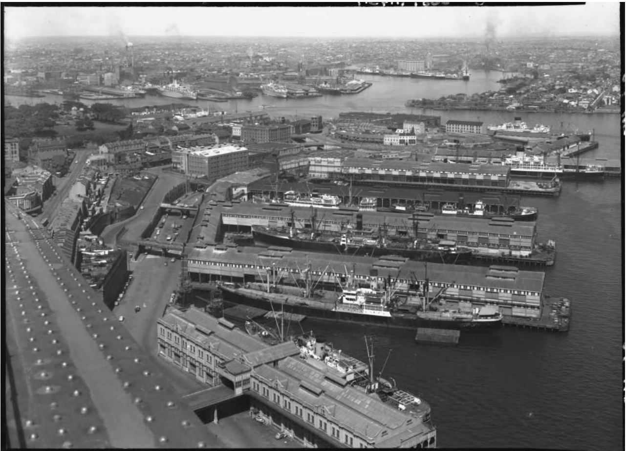
Figure 7: Walsh Bay