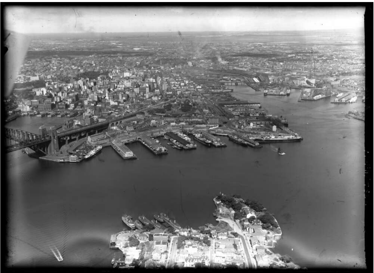
Figure 8: Walsh Bay from above McMahon's