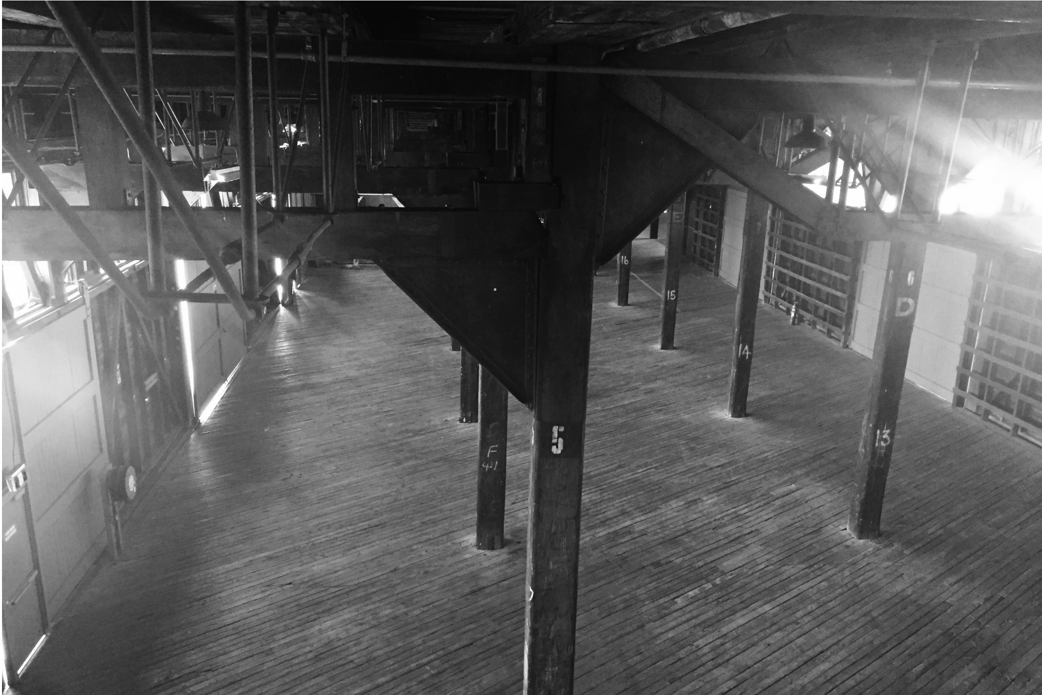
Figure 10: Pier 2/3 foyer

Response The project will include a significant component of heritage interpretation as well as a bespoke signage and wayfinding system within the precinct. The Applicant considers that given the historic significance of the precinct, emphasis should be placed on the development of interpretive displays in lieu of public art. The Applicant has committed to developing the Interpretation Plan in consultation with City of Sydney and the NSW Heritage Council.