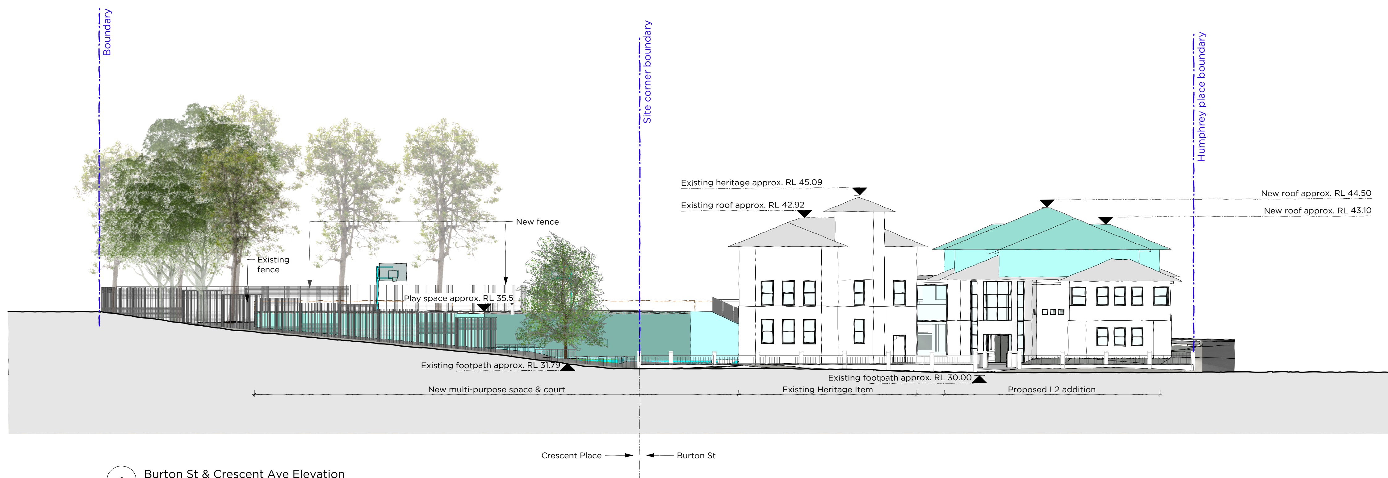
2 Burton St & Crescent Ave Elevation Scale: 1:200