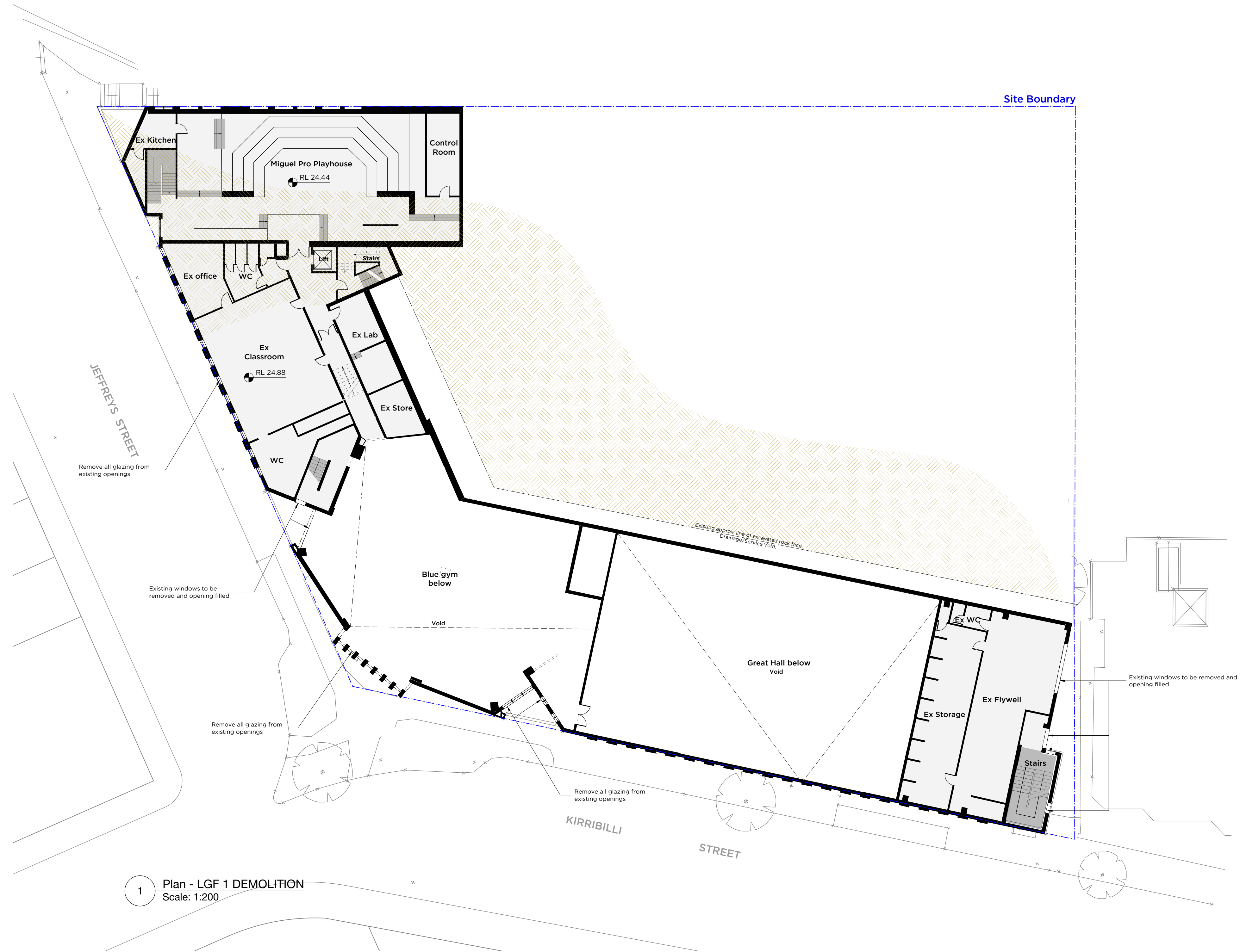
1 Plan - LGF 1 DEMOLITION Scale: 1:200