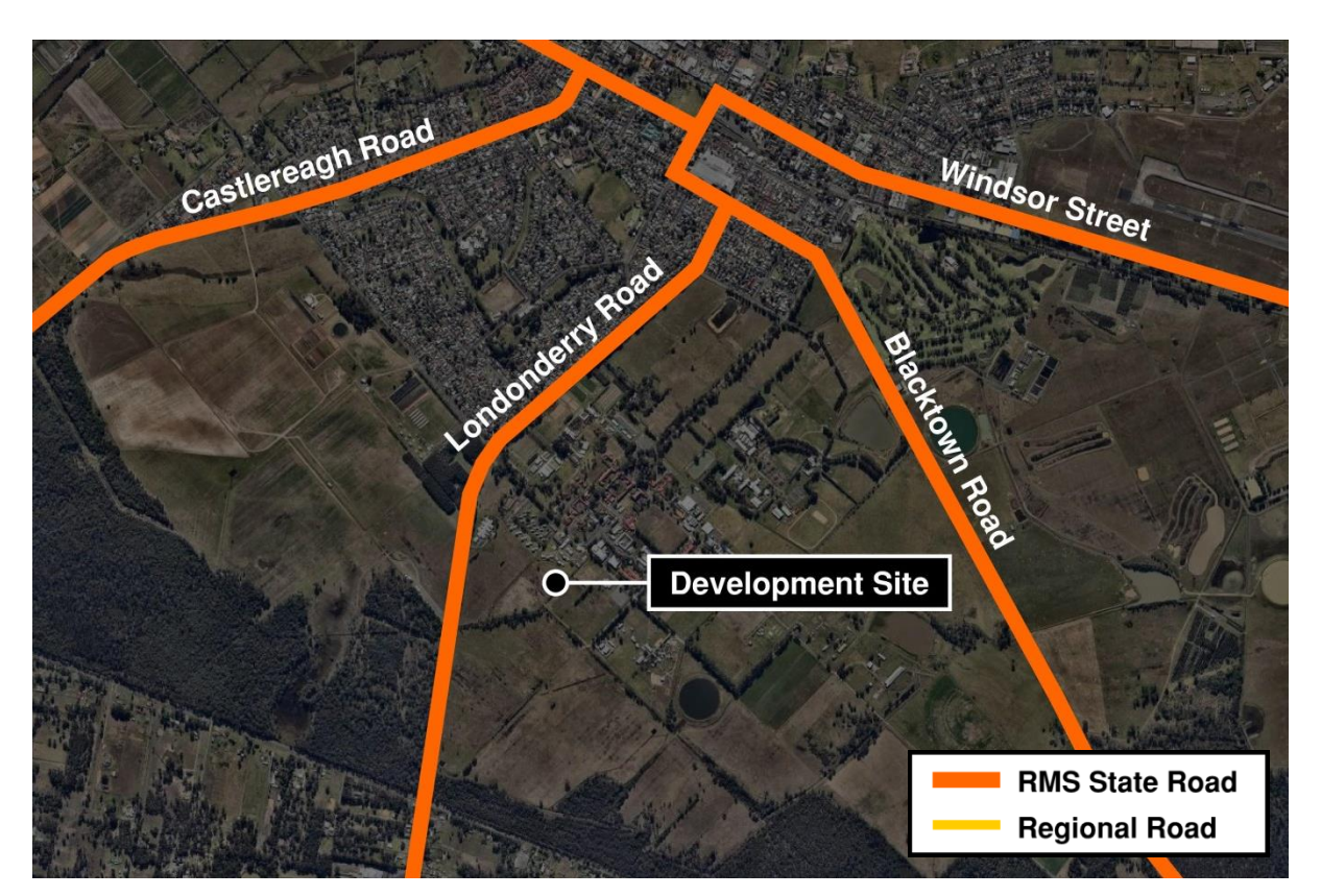
Figure 1.2: State and regional roads