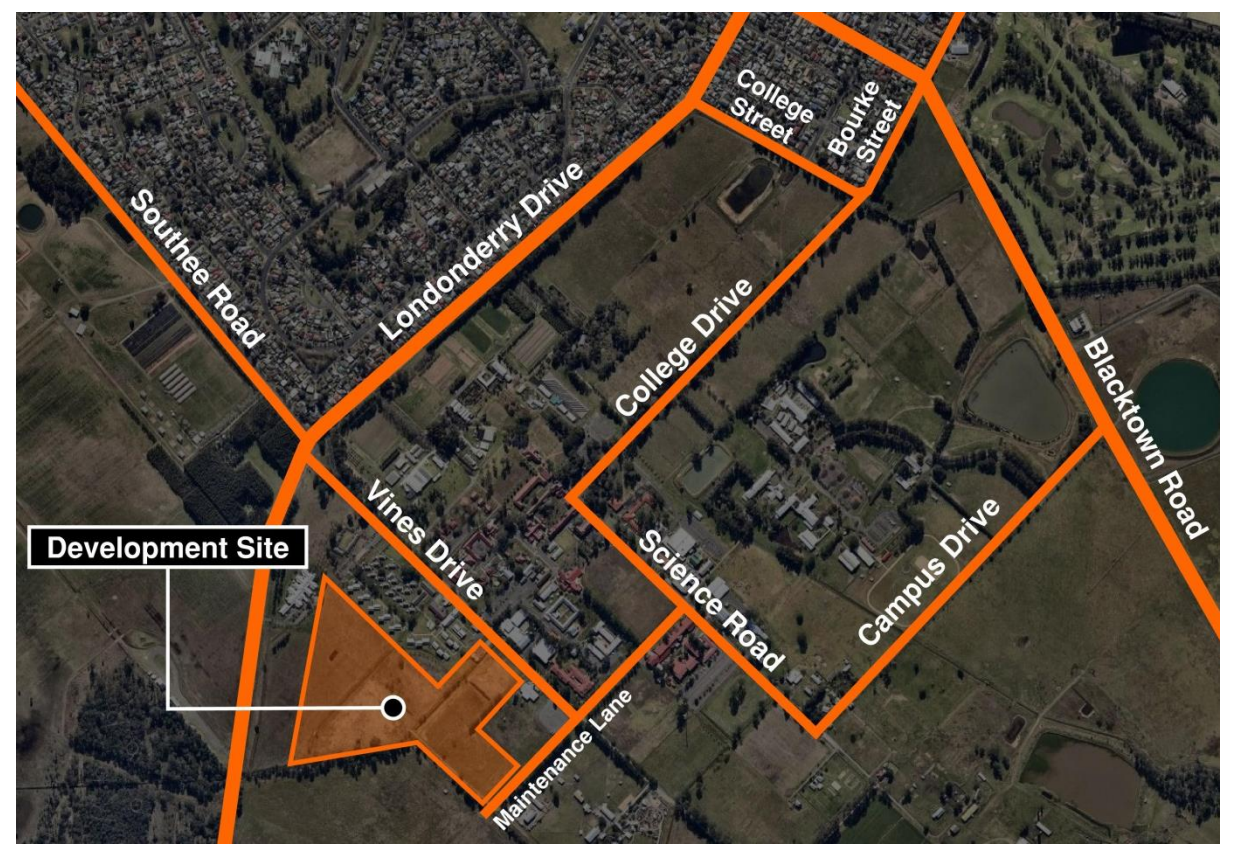
Figure 1.1: Site location Image source: Nearmap (dated 9<sup>th</sup> July 2017)

The site is located close to the NSW state road network. Blacktown Road is approximately 1.8 kilometres and Londonderry Road approximately 650 metres from the site. Blacktown Road provide access to the M7 Motorway (via Richmond Road) at Dean Park. Figure 1.2 illustrates the state and regional roads in the vicinity of the site.