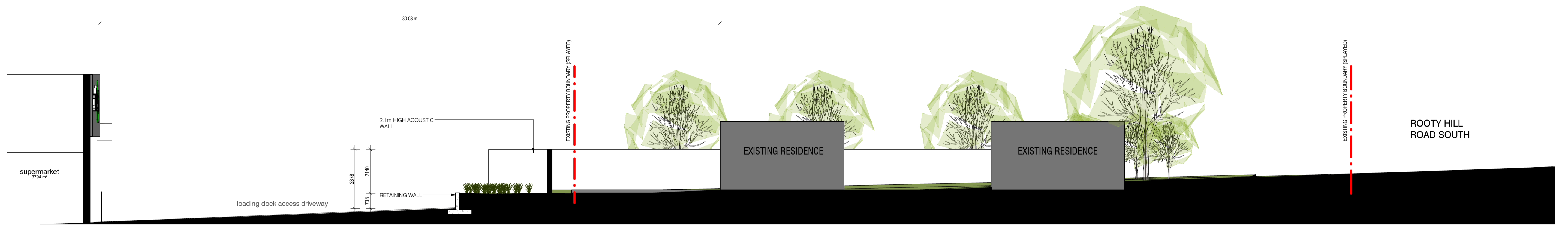
EXISTING RESIDENCE LONG SECTION C 1 : 100